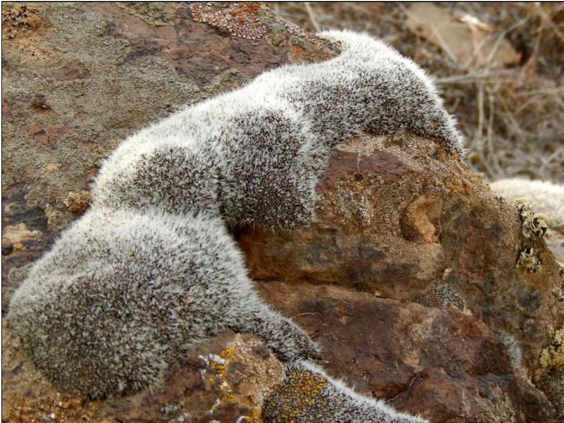
Dry rock moss ( Grimmia anodon ). May 2013. East side of Steens Mountain. Harney County, Oregon.