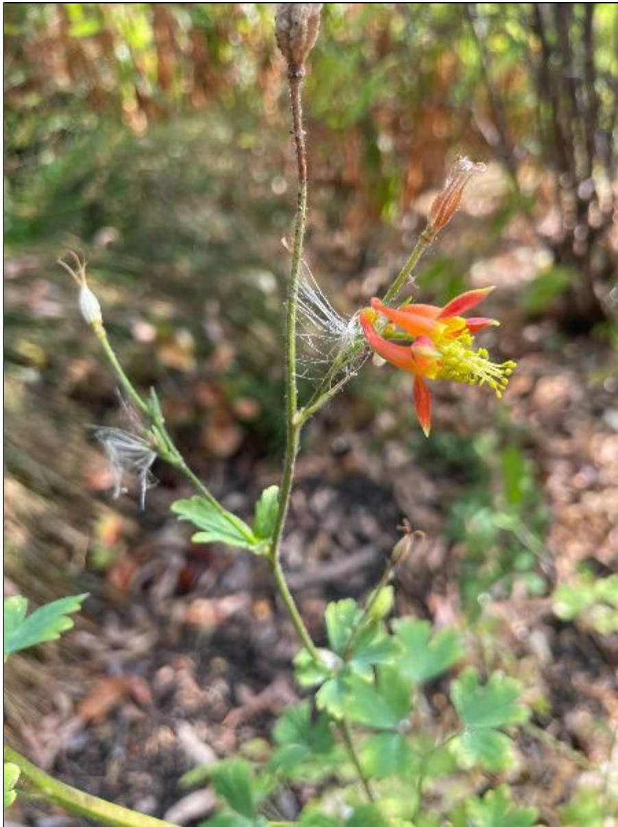
Red columbine ( Aquilegia formosa ) at the native plant garden at the McMinnville Public Library. This garden is maintained by the NPSO Cheahmill Chapter. August 17, 2024.