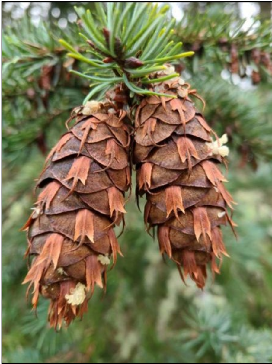
Douglas-fir ( Pseudotsuga menziesii). 2023. Mount Pisgah Arboretum, Lane County, Oregon.

What to do on a rainy day? Join our iNaturalist Winter ID-a-thon February 15-23, 2025.