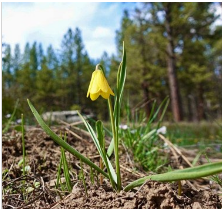
Yellow bells ( Fritillaria pudica ) photographed 4/24/24 at Morning Hill Forest Farm

Celebrating Native Plant Appreciation Month can also involve many individual activities. For example, you might join a local restoration project. You could also visit a native garden, nursery or wildflower show. As you are enjoying our better weather that comes with spring, you might add some natives to your garden! Whatever you do, you can share your photos of the activities with other members of NPSO by submitting them to the photo gallery in the Bulletin . Send photos with the following information: species/event, photographer, names of any people shown in photo, date of photo, location, and any other information you would like to have included in the photo caption to bulletinnpso@gmail.com . Please get consent from any people included in your photo prior to sending it.