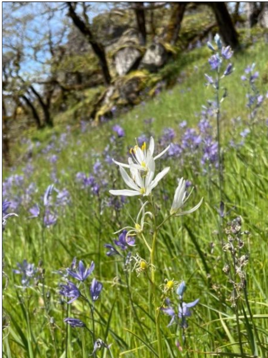
Great Camas Patch, Carson, Washington. May 2022.

The Portland Chapter is proudly hosting the statewide NPSO Annual Meeting at an iconic riverside setting at the award-winning Best Western Plus Hood River Inn during the peak of wildflower season in the Columbia Gorge! The meeting will be held May 16 to May 18, 2025. You must be a current active NPSO member to attend an annual meeting. Renew or have your family or partner join at www.npsoregon.org/membership . Note that each member with a two-person membership (Family, Sustaining, Patron, or Life) must pay the registration fee to cover the conference room costs and to ensure enough seating for the evening banquets.