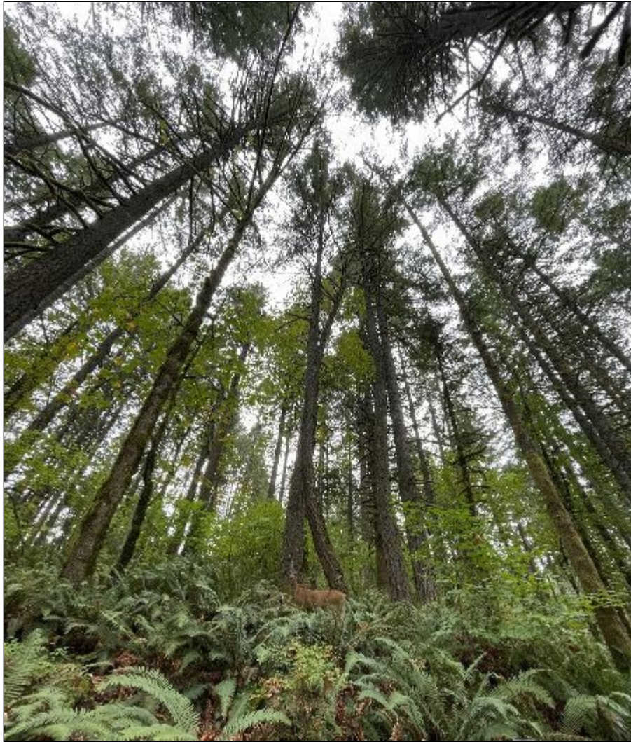
Douglas-fir ( Pseudotsuga menziesii ) and sword fern ( Polystichum munitum ) with deer. September 14, 2024. Miller Woods, near McMinnville, Oregon. This property is owned by the Yamhill Soil and Water Conservation District and is open for public hikes and activities.