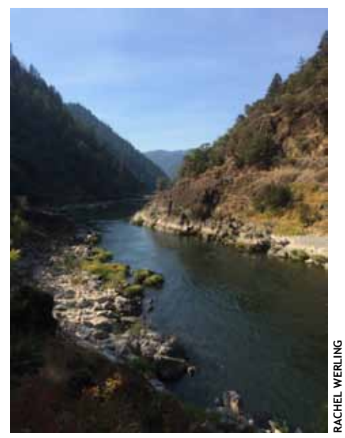
Torrent sedge (Carex nudata) growing along the Rogue River, Oregon.

This article originally appeared in the Fall 2017 issue of The Confluence, the Rogue River Watershed Council's quarterly newsletter. Read more online at rogueriverwc.org.