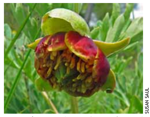
We chose Brown's peony (Paeonia brownii) as our botanical mascot for the 2018 Annual Meeting. It is a common, even abundant, species in appropriate habitats in the Ochoco Mountains.

Friday, Saturday, and Sunday field trip destinations will be on the Ochoco National Forest, Crooked River National Grassland, Bureau of Land