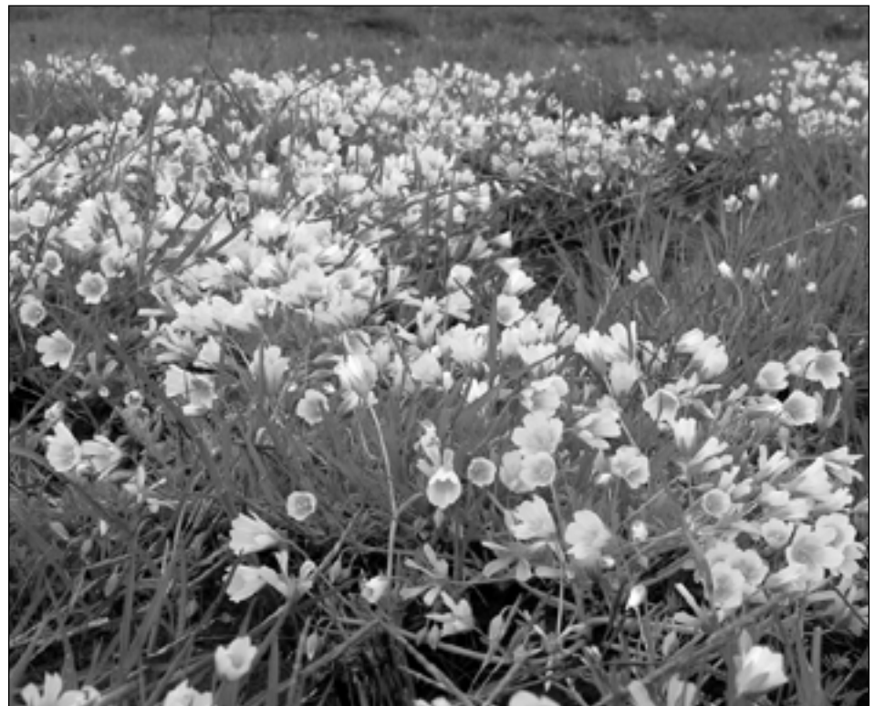
Common meadowfoam (Limnanthes douglasii) creates a dazzling display along North Bank Road near Glide. There are many interesting wildflowers to be seen in the area in late April. On April 28 or 29, stop at the Glide Wildflower Festival first to find them identified, then look for them on your own in the wild.