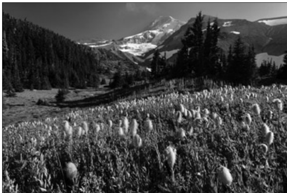
Western pasqueflower (Anemone occidentalis) seedheads at Elk Cove, Mt. Hood Wilderness

Greg Lief, an NPSO member from Corvallis, has started a web site at www.OregonWildflowers.org . The purpose of this site is to provide a community resource for wildflower and photography enthusiasts to share information on where and when to visit Oregon's best wildflower spots. In addition to providing a database of the best Oregon wildflower locations/destinations, visitors are encouraged to participate by adding their own trip reports to share up-to-the-minute conditions with other wildflower lovers. Photographs can also be sent as free e-cards.