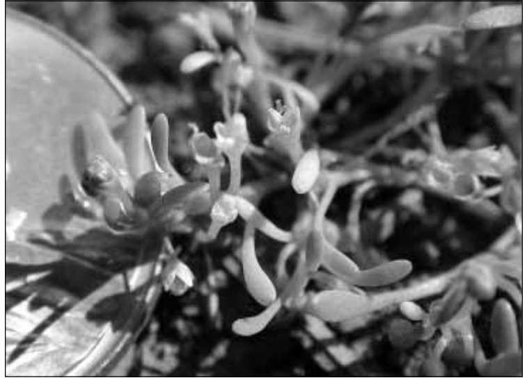
Montia howellii is a diminutive plant in the vernal wet meadows and forest openings at French Flat. Watch your step!

French Flat ACEC occupies 656 acres in Township 40 South, Range 8 West, sections 10, 15, and 22. The ACEC is surrounded by private and BLM lands. There are three public access points, all of which are gated to prevent motorized vehicle use. One access point is opposite the historic town of Waldo on Waldo Road, and the other two are off Rockydale Road (Sheirer Lane and BLM road 15.1). To reach the French Flat ACEC, drive south on the Redwood Highway (99) from Grants Pass, turning east at Cave Junction about ½ mile south of the intersection to the Oregon Caves and follow the Rockydale Road about 4