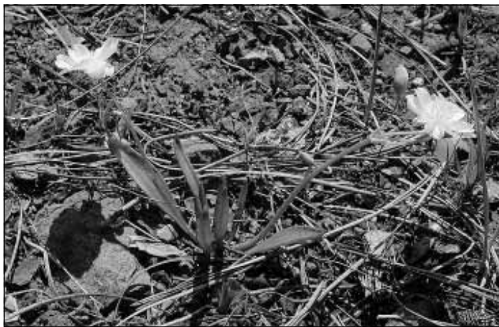
Lewisia oppositifolia , a beautiful white- to pink-flowered endemic to the Klamath Mountains, grows in the shallow soils of open rocky areas.

occasionally, tanoak, and whiteleaf manzanita ( Arctostaphylos viscida ). Understory herbs include Klamath arnica ( Arnica spathulata ), silver-crown ( Cacaliopsis nardosmia ), Siskiyou iris ( Iris bracteata ), western starflower ( Trientalis latifolia ), Henderson's shootingstar ( Dodecatheon hendersonii ), hairy and orange honeysuckle ( Lonicera hispidula , L. ciliosa ), Henderson's fawnlily, pipsissewa ( Chimaphila umbellata ), leafy peavine ( Lathyrus polyphyllus ), mountain sweet cicely ( Osmorhiza berteroi ), varied leaf collomia ( Collomia heterophylla ), golden pea ( Thermopsis rhombifolia var. montana ), blue wildrye ( Elymus glaucus ), false solomon's seal ( Maianthemum racemosum ), pathfinder ( Adenocaulon bicolor ), woodland tarweed ( Anisocarpus madioides ), and fairyslipper ( Calypso bulbosa ). Very similar to the Douglas fir/dry shrub community described by Atzet and others (1996), this community differs in