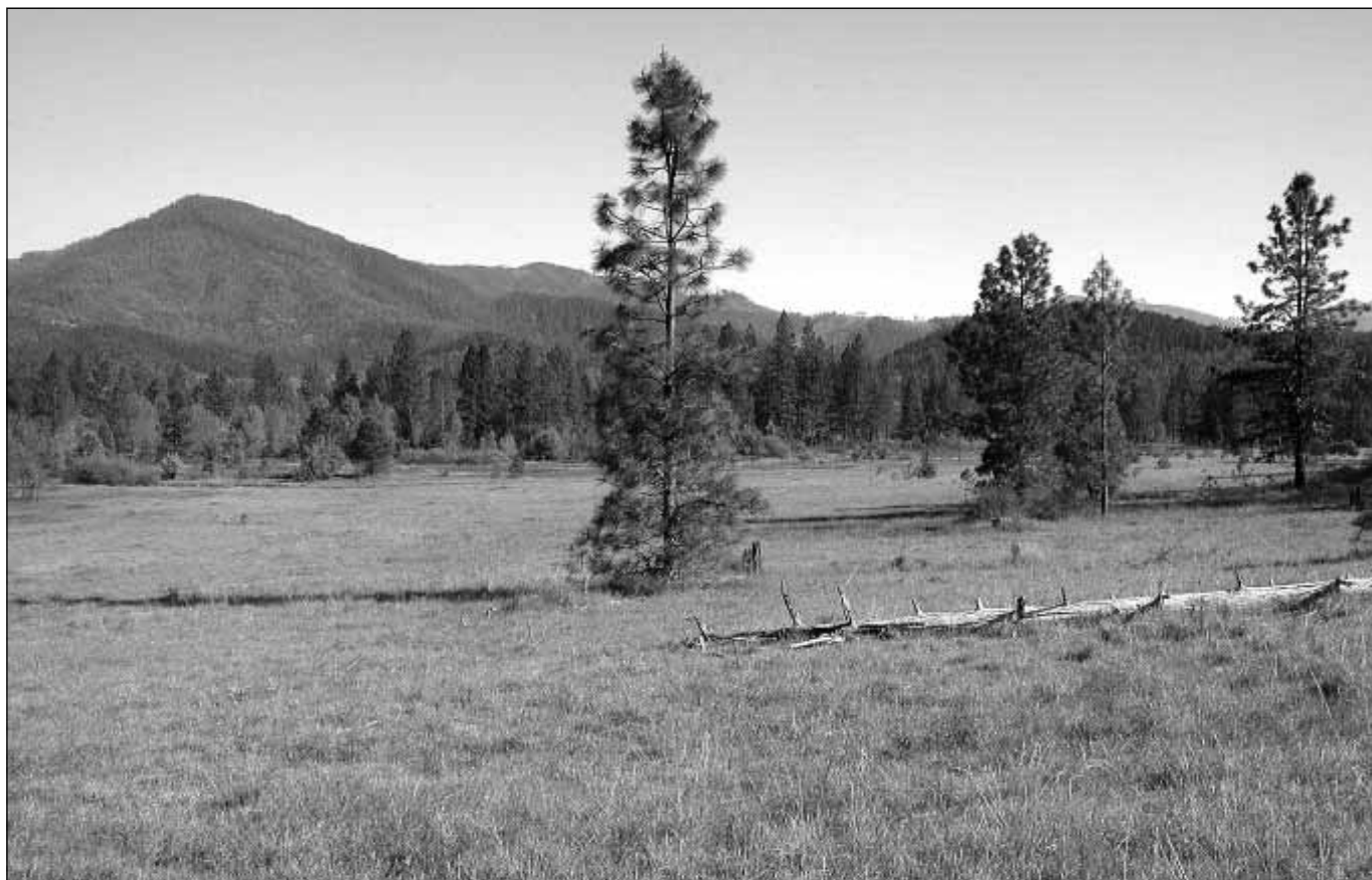
Hope Mountain rises in the background southeast of French Flat. In the foreground, the serpentine-influenced flatlands are dominated by Deschampsia cespitosa and Danthonia californica , the primary plant community that supports extensive populations of Lomatium cookii .

Ranging between 1450 and 1525 feet elevation, the rolling hills and flats of this gentle landscape lie between the east and west