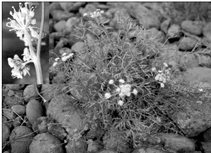
Lomatium cookii , a Federally endangered species, is distinguished by its simple, linear (or narrowly lanceolate) involucre bractlets.

This plant association occupies areas of serpentine alluvium at French Flat. The soils tend to be fine silts to clays, with cobbles and gravels mixed in on gentle slopes. Moisture levels in the soil appear to range from mesic to hydric. As indicated by the name,