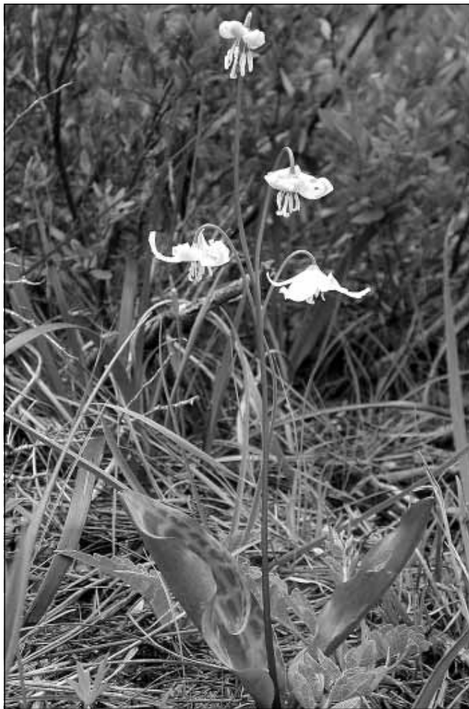
Erythronium howellii , an elegant lily with white to cream flowers, is endemic to open woods and forest edges on serpentine soils in southwestern Oregon and adjacent northern California.