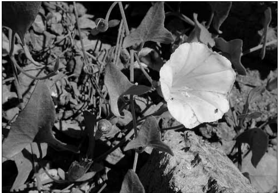
Calystegia californica grows on the serpentine-influenced soils of Jeffrey pine savannas.

naked desert parsley ( Lomatium nudicaule ), mallow sidalcea ( Sidalcea malviflora ), California fescue ( Festuca californica ), Sandberg bluegrass ( Poa secunda ), and soap plant. Serpentine parent materials evidently influence the soils under this community type, but apparently as mixed alluvium so the influence varies from weak to medium. This community type keys to a ponderosa pine-California black oak association in Atzet and others (1996), but has a different shrub component and occurs at lower elevations than those authors describe (1400 to 1600 vs. 3820 feet). Borgias (1991) referred to this community type at French Flat as Pinus ponderosa-Quercus garryana-Q. kelloggii/Arctostaphylos viscida woodland chaparral.