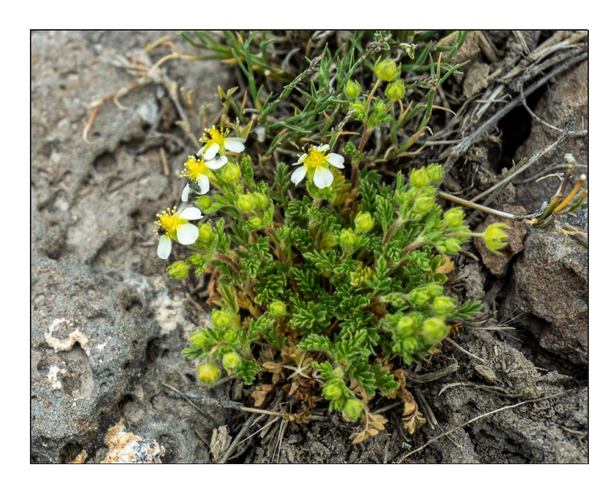
Found growing in the saline/alkaline silty soil in a playa around a small, internally drained basin, in the shrub steppe south of Brothers, Oregon. Photographed June 6, 2021, by Cindy Roché

Do you have an Oregon Mystery Plant to share? Send it to the editor: <u>bulletin@npsoregon.org</u>