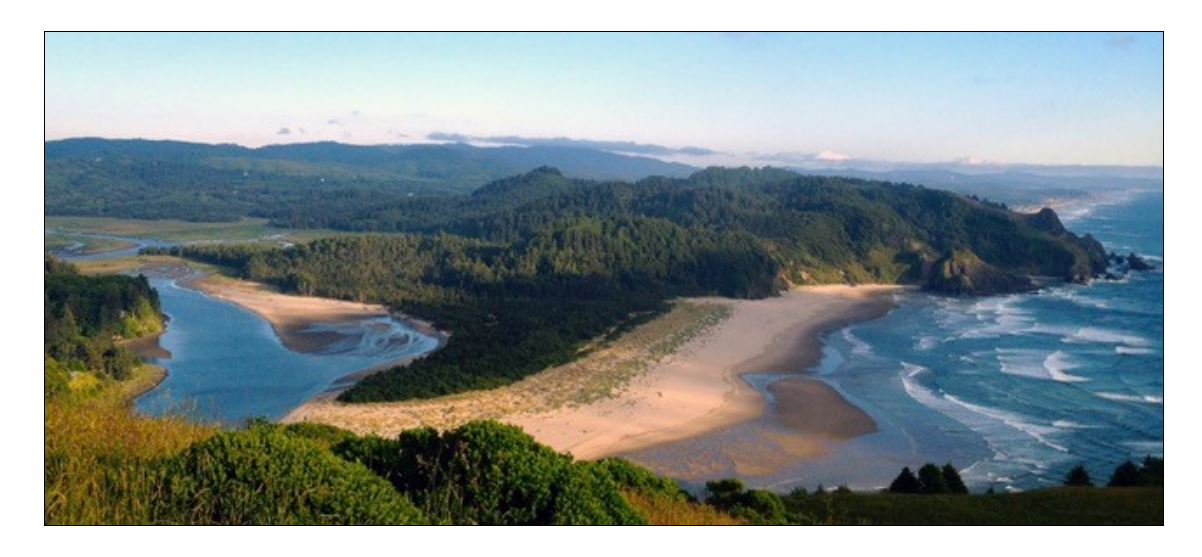
UNESCO Cascade Head Biosphere Reserve: site of five field trips

Field trips will visit Willamette Valley oak savannas and prairies, coastal forests, beaches, and estuaries. Featured will be efforts by groups, including the Confederated Tribes of Grand Ronde (CTGR), the Nature Conservancy, Sitka Center for Art & Ecology, Institute for Applied Ecology, Yamhill Soil & Water District, U.S. Forest Service, and U.S. Fish & Wildlife Service, all of which are actively involved in restoring native habitats.