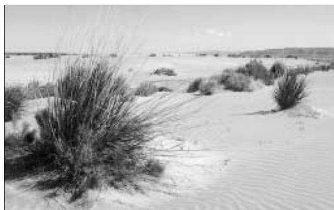
Basin wildrye in sand dunes with greasewood ( Sarcobatus vermiculatus ) in Oregon's Great Basin country.

Basin wildrye is susceptible to grazing damage, which is most severe when livestock use it during early spring when it is actively growing. It tolerates moderate dormant season (winter or fall) grazing. Differences in plant density after grazing can be dramatic (see photo of road right-of-way, p. 3). It tolerates fire well. Basin wildrye plants whose tops have been totally scorched by fire sprout vigorously the following spring. Basin wildrye communities are usually fully recovered to pre-burn conditions four years after burning ( www.fs.fed.us/database/feis/ ).