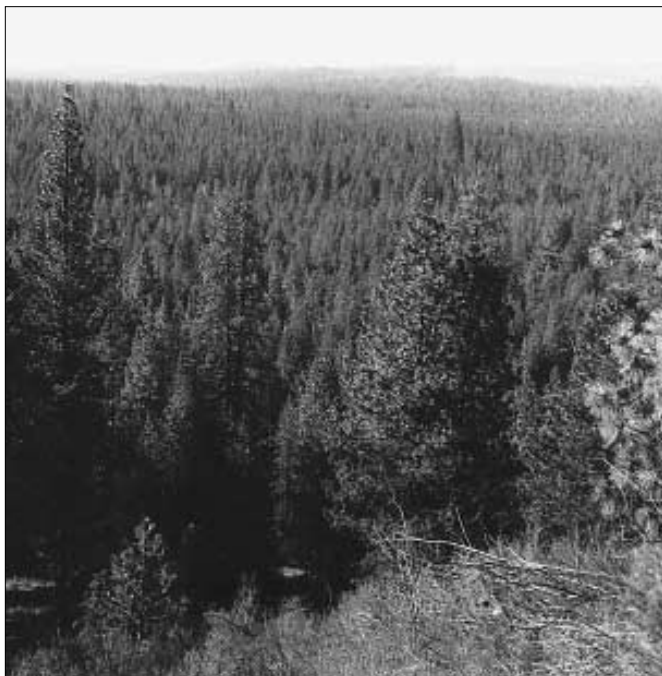
Sugar pine in a mixed coniferous forest north of Klamath Marsh.

This was not the time of year for the kind of botanical collections which would excite the “closet naturalists” back east, who anticipated the indoor scrutinizing, describing, and naming of new flora....which they themselves had not collected. But Frémont was enjoying the trek through new country, at first with deciduous creek bottoms dominated by oaks ( Quercus garryana , Oregon white oak, encountered by Archibald Menzies and by Lewis and Clark along the Columbia River, but named and described by David