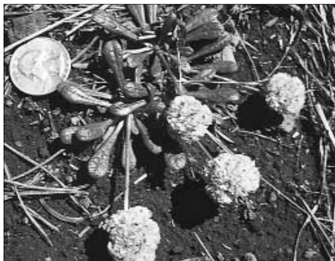
Umbellate pussypaws ( Calyptridium umbellatum ).

I began studying the vegetation of the Pumice Desert in 1965 with 22 line transects. In addition, lodgepole pine were tabulated in a 100-acre plot. Nine of the transects and the four corners of the 100-acre plot were marked with iron rods for future monitoring. I resampled the line transects in 1977 and 1995. Over the years, I recorded only fourteen species of plants in the line transects, in contrast to the 570 species in the flora of Crater