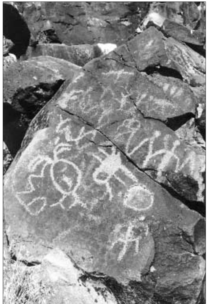
Petroglyphs along a basalt rim in Lake County, Oregon.

An interesting aspect of wildrye ecology is a fungus that attacks it from time to time. Occasional seedheads can be found with a black seedlike protrusion on them. This protrusion is Claviceps purpurea , black ergot. The fungus life cycle begins when a fungal mycelium invades the ovary of the seed and forms a dark purple to black structure that looks like a grain of wheat. The hard shell of the structure contains alkaloids that were responsible for the ergot poisoning (St. Anthony's Fire) that was endemic in Europe