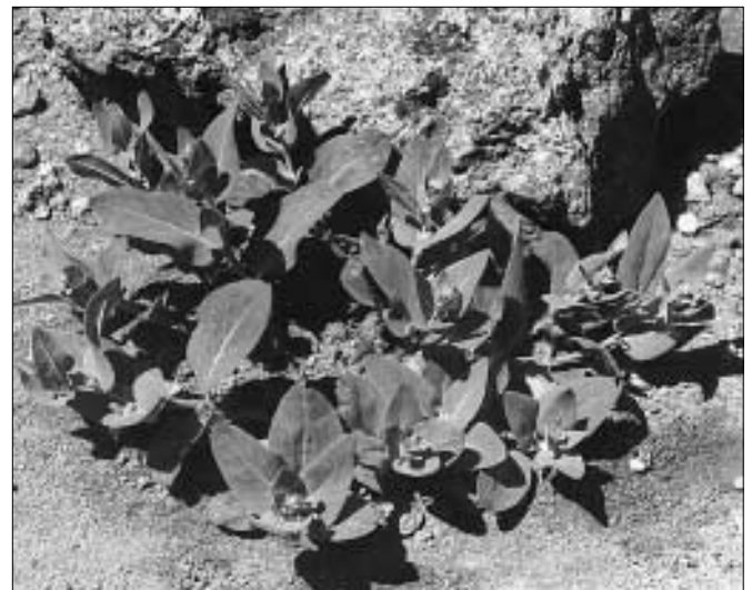
Newberry fleecflower ( Polygonum newberryi ).

Calyptridium umbellatum further reduces desiccation by its prostrate habit in which the leaves form a flat rosette. This species has an additional adaptive characteristic: its leaves lie flat on the surface of the ground in the morning when it is cool, then as the soil heats, slowly lift off the hot surface, until evening when they return to the cooling surface. The leaves of this species do