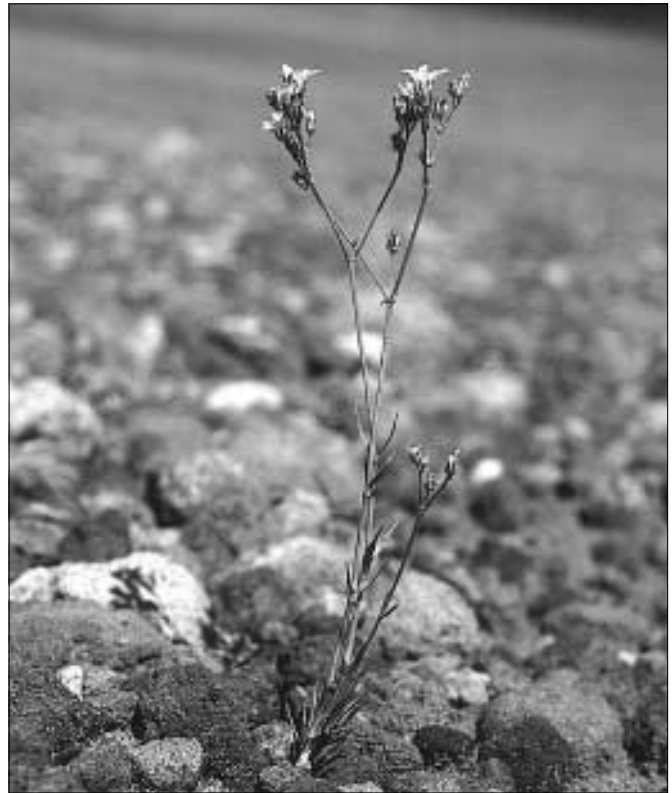
Pumice sandwort ( Arenaria pumicola ).

All but one of the fourteen plant species on the Pumice Desert are perennial herbs or small shrubs. The exception is lodgepole pine scattered throughout the area. Most of the plants have various adaptations typical of desert and alpine communities. Using nomenclature from Hickman (1993) and Hitchcock and Cronquist (1973), the following list describes those fourteen species.