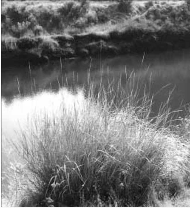
Basin wildrye along the Crooked River near Smith Rock, Oregon.

communities. There is perhaps a similar situation for a rare plant near Burns, Oregon.