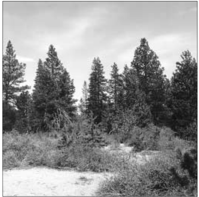
Lodgepole pine and other conifers near the Little Deschutes River south of Bend, Oregon, on Frémont’s 1843 route.