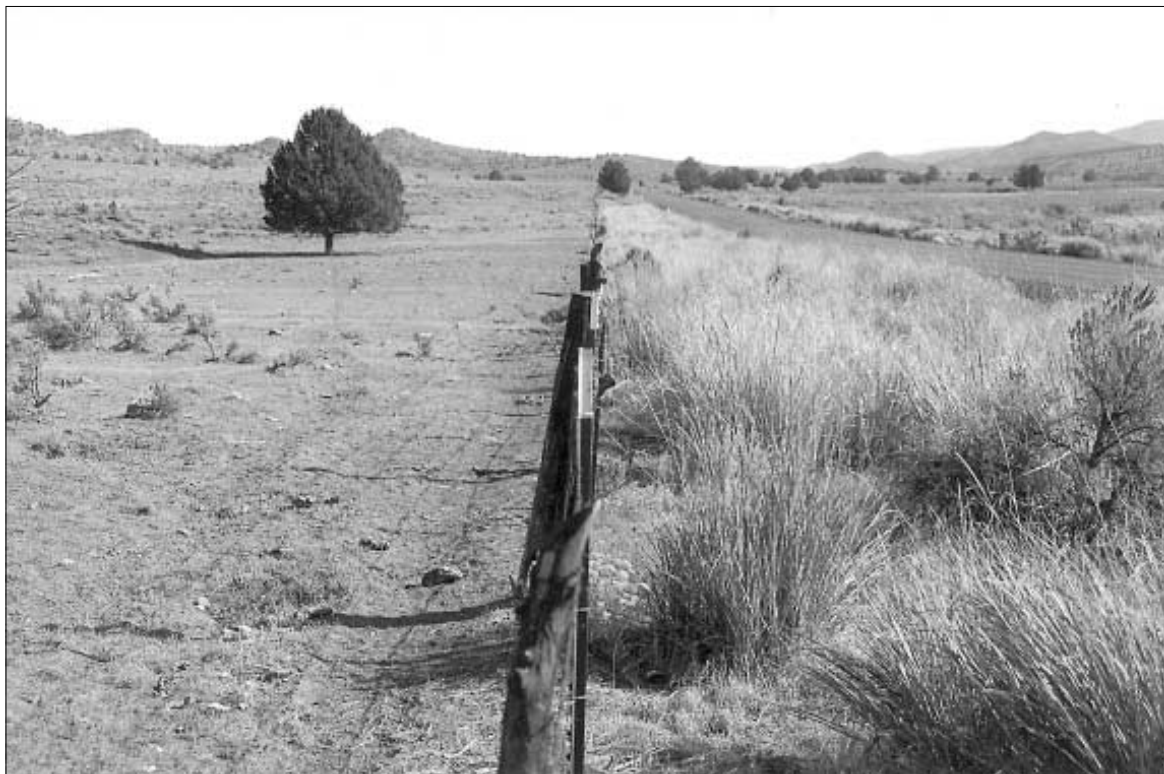
Fenceline contrast in basin wildrye community along ungrazed highway right-of-way in central Oregon.