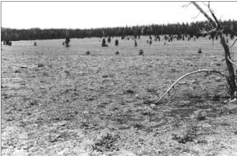
The same view in 1995 after the tree had died. Also note the increased number of lodgepole pines in the background.

The majority of new trees observed were near the periphery of the Pumice Desert, close to the forest edge. Fewer trees were found in the center of the area. It is logical to expect plant succession to proceed more quickly at the edge of the Pumice Desert than in the center. The growing season on the Pumice Desert is short. Success-