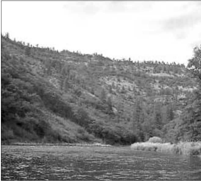
The narrow riparian zone of the upper Klamath River canyon.

and have periodically open niches as the result of flooding, bank erosion, and the deposition of mixed gravels and silts.