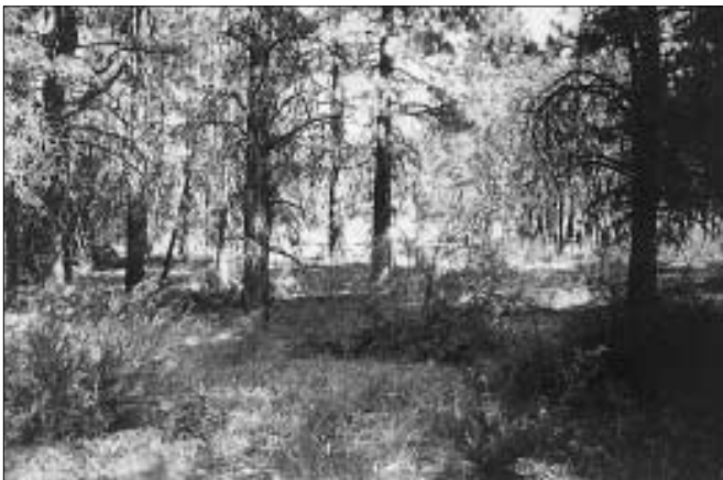
The coniferous forest surrounding the upper Klamath River canyon. Species visible in photo include Pinus ponderosa , Ceanothus cuneatus , Symphoricarpos albus and Amelanchier utahensis .

By dissecting the Cascades, the upper Klamath River forms a natural corridor between the Great Basin and California floristic provinces, with the resulting vegetation classed as “Transition Zone” (Bailey 1936). High levels of floristic variation result from the intermingling of characteristic regional plants across this semi-permeable boundary. In addition to this floristic provincial overlap, the area shows wide ecotonal variation due to its topography and drainage pattern. Todt (1998) noted that “the upper reach of the Klamath River, as it flows through the Cascade Mountains, is the most botanically heterogeneous landscape along its entire course.” Relic and disjunct plant communities from past environmental changes may have contributed to this present diversity (Todt 1990). According to Franklin and Dyrness (1988), the upper Klamath River canyon area supports both interior valley and mixed conifer vegetation zones. On a landscape level, these