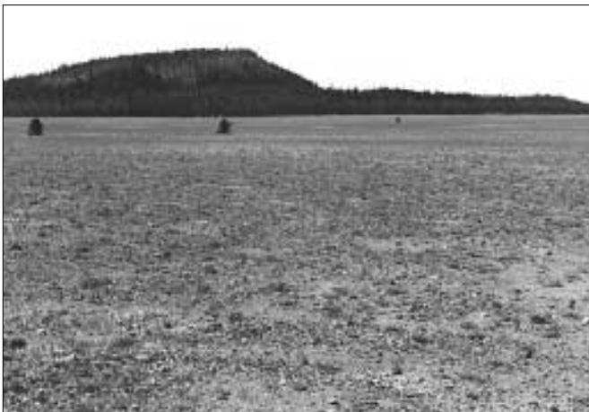
View across the Pumice desert from eastern corner of the tree plot in 1965.

The Pumice Desert consists of a large east-west wedge-shaped opening in the lodgepole pine forest that carpets the northern portion of the park. The slight depression in the center of the generally flat, rather homogenous area may have resulted from either the original valley topography or a slight settling of the pumice substrate. There are two elevation benchmarks in the area. The first records an elevation of 5,962 feet where the road crosses the center of the Pumice Desert at its lowest point, and the second one, on the southern ridge, records 6,010 feet, probably representing one of the highest points. This difference in elevation occurs over a distance of about a quarter mile, causing a gentle north and south facing slope across the surface. Topographic relief in the Pumice Desert consists of minor ridges and depressions, creating dry washes. The pumice soil is very loose and porous, allowing water to infiltrate quickly.