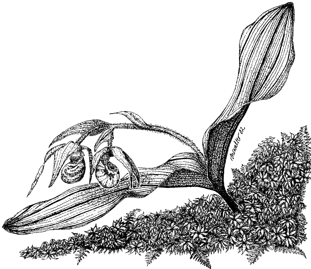
Clustered lady's slipper ( Cypripedium fasciculatum)