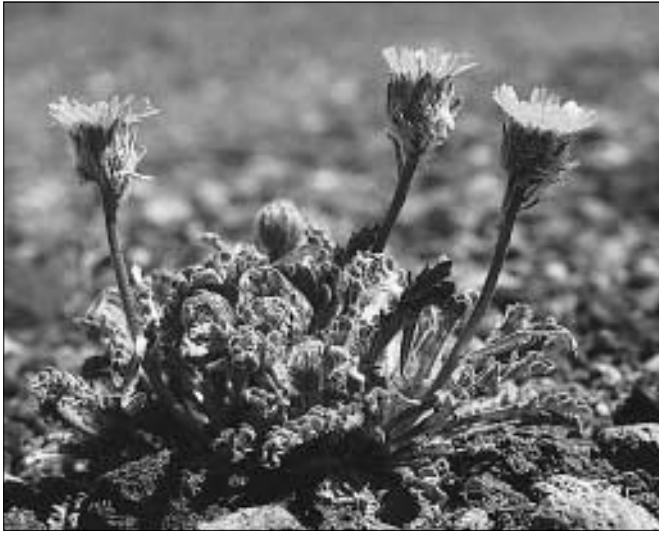
Dwarf hulsea ( Hulsea nana).

It flowers in late June and sets fruit in mid-July. By mid-August, most of the plant has dried and the seeds have dispersed.