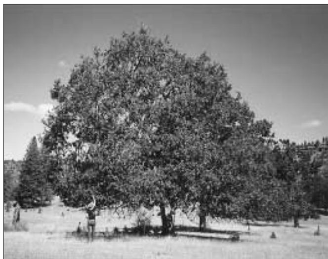
Oregon white oak savanna, floor of the upper Klamath River canyon.

Oaks are the other major codominant with ponderosa pine, forming a pine/oak forest community that covers about 20% of the canyon area. Pine/oak forests are found primarily in the lower canyon, as well as in the uplands of the southern area surrounding the canyon. In the canyon and along the canyon's edge, the codominant oak is Oregon white oak ( Quercus garryana ). California black oak ( Quercus kelloggii ) is also found as a codominant in canyon communities, primarily in the southern portion of the area. In the southern ponderosa pine-dominated forests, California black oak is also found as an understory shrub. Relatively minor amounts of understory characterize the pine/oak community, consisting of annual or perennial grasses with occasional copses of shrubs. Native perennial grasses are primarily fescue species ( Festuca idahoensis ). Potential understory shrubs include species common in the drier portions of the mixed coniferous forest: serviceberry, snowberry, Oregon grape, various buckwheats, and deerbrush ( Ceanothus integerrimus ). A few of the understory forbs include pussytoes ( Antennaria argentea , A. dimorpha , A. howellii , A. rosea ), yarrow ( Achillea millefolium ), sweet cicely ( Osmorhiza occidentalis , O. purpurea ), bedstraw ( Galium aparine , G. bolanderi , G. boreale ), and balsamroot ( Balsamorhiza deltoidea , B. sagittata ).