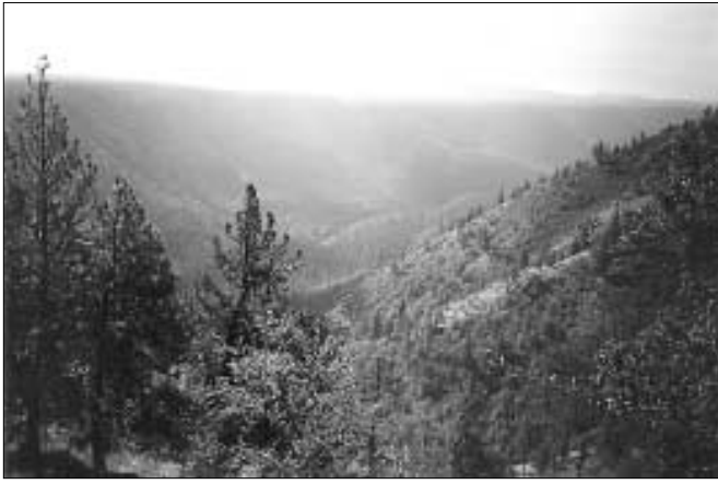
The upper Klamath River gorge, Oregon (camera facing southwest).

By dissecting the Cascades, the upper Klamath River forms a natural corridor between the Great Basin and California floristic provinces, with the resulting vegetation classed as “Transition Zone” (Bailey 1936). High levels of floristic variation result from the intermingling of characteristic regional plants across this semi-permeable boundary. In addition to this floristic provincial overlap, the area shows wide ecotonal variation due to its topography and drainage pattern. Todt (1998) noted that “the upper reach of the Klamath River, as it flows through the Cascade Mountains, is the most botanically heterogeneous landscape along its entire course.” Relic and disjunct plant communities from past environmental changes may have contributed to this present diversity (Todt 1990). According to Franklin and Dyrness (1988), the upper Klamath River canyon area supports both interior valley and mixed conifer vegetation zones. On a landscape level, these