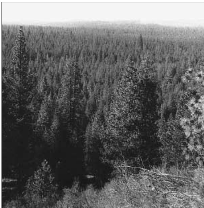
Sugar pine in a mixed coniferous forest north of Klamath Marsh.

This was not the time of year for the kind of botanical collections which would excite the “closet naturalists” back east, who anticipated the indoor scrutinizing, describing, and naming of new flora....which they themselves had not collected. But Frémont was enjoying the trek through new country, at first with deciduous creek bottoms dominated by oaks ( Quercus garryana , Oregon white oak, encountered by Archibald Menzies and by Lewis and Clark along the Columbia River, but named and described by David