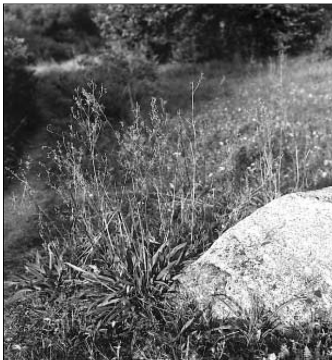
Kooyah ( Valeriana edulis) in late summer, as Frémont would have encountered it.