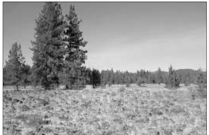
Lithosol meadow, upland plateau, upper Klamath River canyon region. Tree species are Pinus ponderosa and Juniperus occidentalis .

A few herbaceous dicots commonly occur in lithosol meadows, including yampah ( Perideridia bolanderi , P. erythrorhiza , P. gairdneri , P. oregana ), biscuitroot ( Lomatium bicolor , L. dissectum , L. macrocarpum , L. nudicaule , L. piperi , L. triternatum , L. vaginatum ), broom-rape ( Orobanche uniflora ), owl clover ( Orthocarpus bracteosus , O. imbricatus , O. luteus ), vinegar weed ( Trichostema lanceolatum , T. oblongum ), large-headed clover ( Trifolium macrocephalum ), and daggerpod ( Phoenicaulis cheiranthoides ). Liliaceous monocots are found in lithosol meadows in great numbers and varieties, including several species of wild onion ( Allium acuminatum , A. amplexens ,