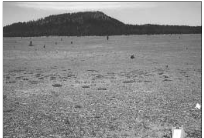
The same view in 2000. Note increased number of trees.