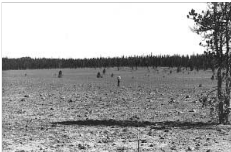
Plot on the eastern portion of the Pumice Desert in 1977 showing multi-stemmed lodgepole pine, in right foreground.

Soil measurements in 1965 revealed that surface temperature extremes and low fertility may be limiting factors for plant establishment. Soil temperatures fluctuate widely on clear days. Soil surface and air temperatures were similar only on cloudy days.