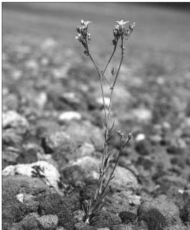
Pumice sandwort ( Arenaria pumicola ).

All but one of the fourteen plant species on the Pumice Desert are perennial herbs or small shrubs. The exception is lodgepole pine scattered throughout the area. Most of the plants have various adaptations typical of desert and alpine communities. Using nomenclature from Hickman (1993) and Hitchcock and Cronquist (1973), the following list describes those fourteen species.