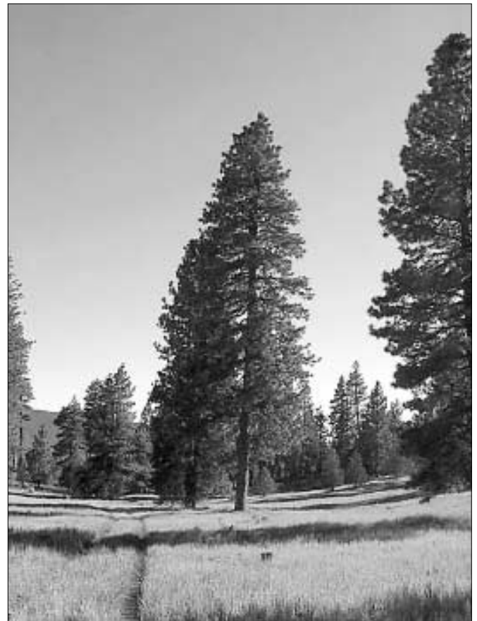
Ponderosa pine on a forest edge, Grizzly Butte, upper Klamath River canyon.

Understory vegetation of the mixed coniferous forest varies by overstory coverage, soil, moisture, elevation, and aspect. Moisture and soil depth appear to be two major factors determining species distribution and abundance. Common understory species include shrubs: snowberry ( Symphoricarpos albus ), manzanita ( Arctostaphylos patula ), Oregon grape ( Berberis aquifolium ), serviceberry ( Amelanchier utahensis ), mahala mat ( Ceanothus prostratus ), snowbrush ( Ceanothus velutinus ), baldhip rose ( Rosa gymnocarpa ), and chinquapin ( Chrysolepis chrysophylla ). These shrubs generally dominate small openings in this community, such