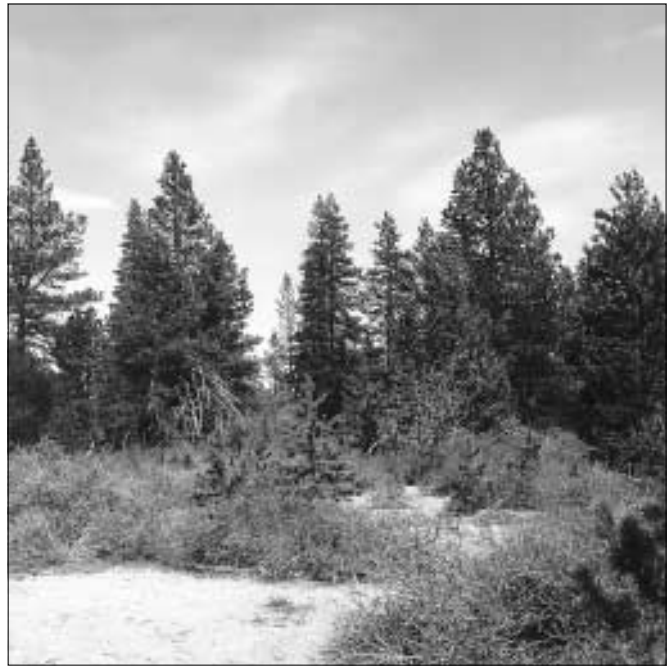
Lodgepole pine and other conifers near the Little Deschutes River south of Bend, Oregon, on Frémont’s 1843 route.