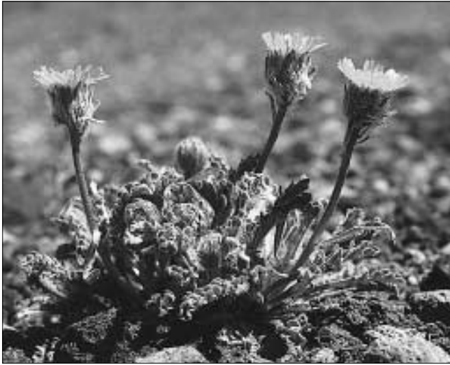
Dwarf hulsea ( Hulsea nana).

It flowers in late June and sets fruit in mid-July. By mid-August, most of the plant has dried and the seeds have dispersed.