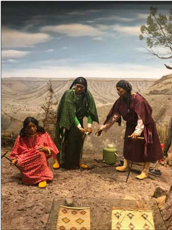
Digging tools and skills for extracting edible roots were passed down from experienced older women to tribal girls.

ground to maintain the population for future harvests. This practice, which botanists call intensification, increased the yields of certain plants in areas where they grew best: “We give back a portion of what we’re given” (French 1952-58).