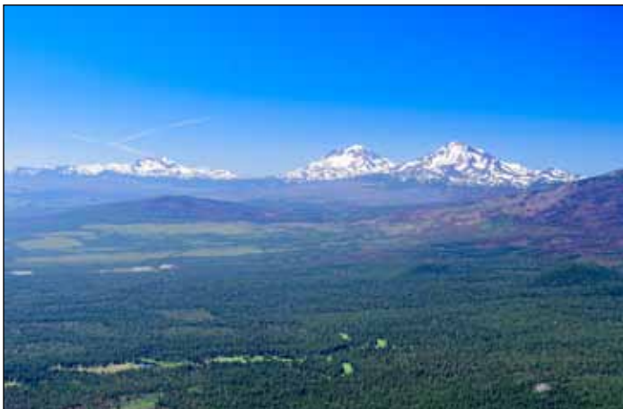
Cascade Peaks.

In addition to the two publications, he recognized the need for a well-organized study herbarium for the Reservation, for which he carefully identified and labeled 600 specimens. This collection is available for study by contacting the tribal Department of Forestry offices in Warm Springs. Helliwell left the Warm Springs Reservation in 1989 and has since worked as a botanist for the Mt. Hood, Ochoco and Umpqua National Forests.