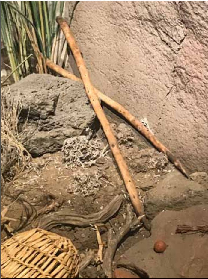
Mountain mahogany ( Cercocarpus ledifolius ) wood was hardened by heat as it was made into root digging sticks.

Valley. When those fertile lands were occupied, emigrants looked to settle in eastern Oregon. But by then the Reservation lands had been defined by treaty for several decades, making them off-limits to settlers' claims. From the time the treaty was ratified in 1859, non-Indians found it difficult to obtain any access to the Reservation.