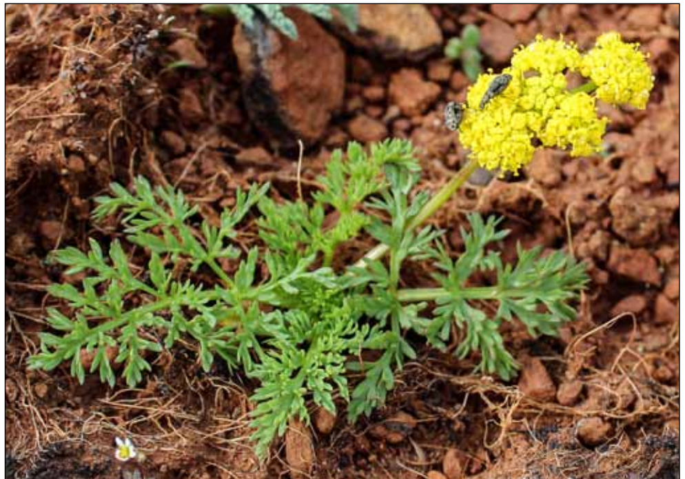
Lomatium watsonii is described as “much like a small form of L. cous, with yellow flowers and a thickened elongate taproot.”