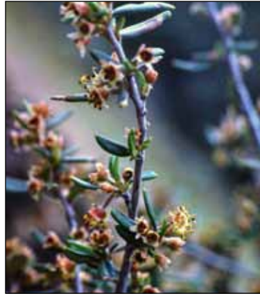
Mountain mahogany flowers. Photo by R.H. Ettinger on May 1, 1976 near Smith Rocks.

It was not until 1949 that the first road (Highway 26) was paved through the Reservation. The Confederate Tribes of the Warm Springs acquired the nearby hot springs in the 1960s and in the following decade opened