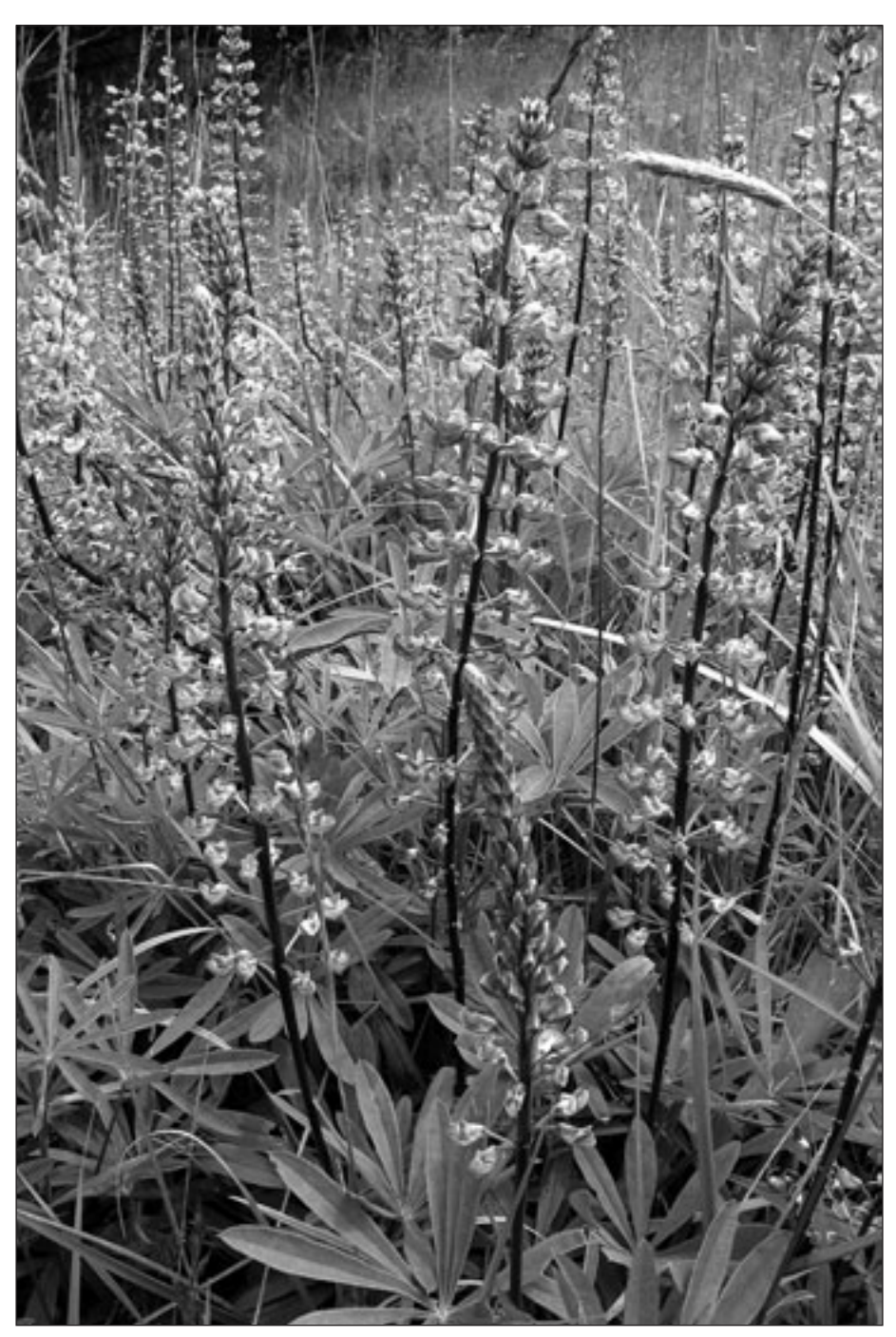
Kincaid's lupine ( Lupinus sulphureus ssp. kincaidii) is listed as a threatened species by the US Fish and Wildlife Service, and still survives in a few prairie remnants and on roadsides in Yamhill County. It is the food plant for the larvae of the endangered Fenders' Blue Butterfly.