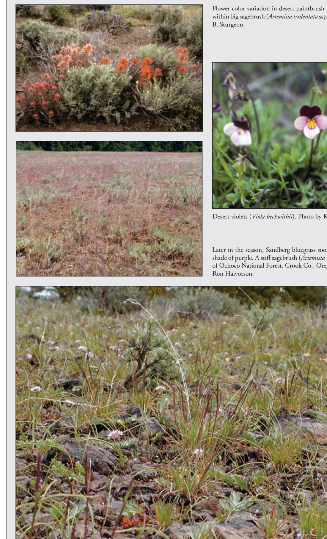
Flower color variation in desert paintbrush (Castilleja chromosa) growing within big sagebrush (Artemisia tridentata ssp. tridentata).