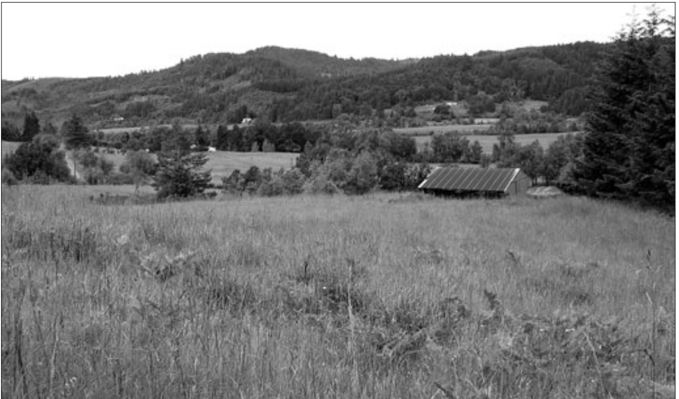
The Summers undoubtedly would have spent time in Gopher Valley, west of McMinnville, in the late 1800's. While the landscape has changed and the native prairie flora has been greatly reduced, The Nature Conservancy's Yamhill Oaks Preserve still supports remnants of native prairie vegetation, including Kincaid's lupine, which blooms in late May and early June.

These journal entries were apparently written following their return to McMinnville, for the entries contain the names