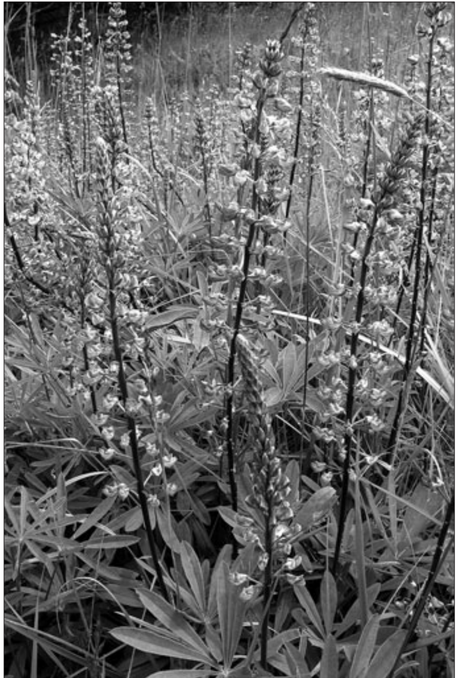
Kincaid's lupine ( Lupinus sulphureus ssp. kincaidii) is listed as a threatened species by the US Fish and Wildlife Service, and still survives in a few prairie remnants and on roadsides in Yamhill County. It is the food plant for the larvae of the endangered Fenders' Blue Butterfly.