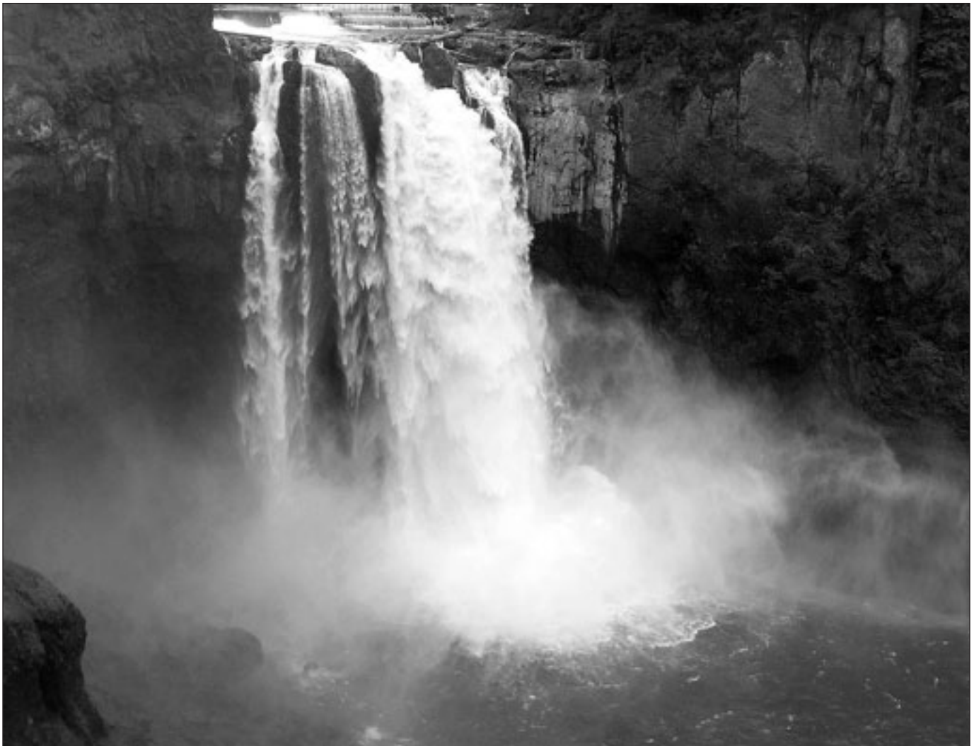
Snoqualmie Falls is still a popular tourist attraction, and is an impressive spectacle when the river is running high.