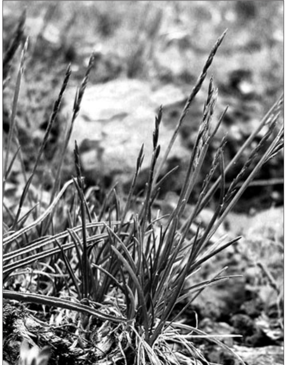
A typical Sandberg bluegrass plant, pre-anthesis. Purplish tinted spikelets arise from a short tuft of basal leaves. Photo from above the North Fork of the Crooked River, Crook County, taken May 7, 2010 by Ron Halvorson.

In botany (and zoology), every species name is based upon one particular specimen – the “reference” specimen upon which the scientific description is written. Since different people may have unwittingly collected and described the same plant at different times