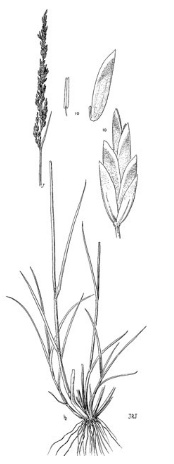
Nevada bluegrass ( Poa nevadensis) has been submerged into Poa secunda subsp. juncifolia.

Mountains in Oregon. Therefore, portions of the discussion, either intentionally or unintentionally, will tend to favor the smaller members of ssp. secunda .