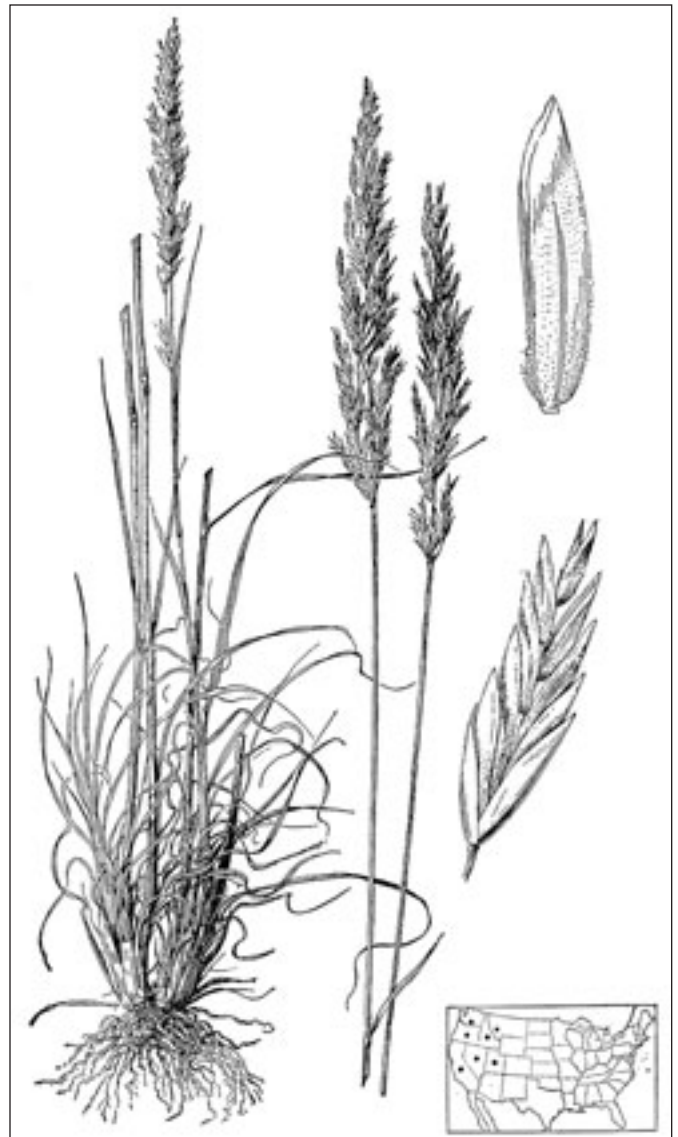
Line drawing of Sandberg bluegrass by Agnes Chase that appeared in A.S. Hitchcock's Manual of the Grasses of the United States , as Poa scabrella , which is now a synonym for Poa secunda subsp. secunda .

As a result, many taxonomists have synonymized (lumped) several heretofore separate taxa into one: Poa secunda . Some current treatments further separate P. secunda into two morphologically different forms, subsp. juncifolia and subsp. secunda . Although this seems like radical new work to many botanists (for some, blasphemy), it has been in process for nearly 60 years (Soreng, pers. comm.), and is the tack taken in the upcoming Flora of Oregon (Wilson, pers. comm.). In the splitter's camp, some maintain that unique phenotypes exist and that they should