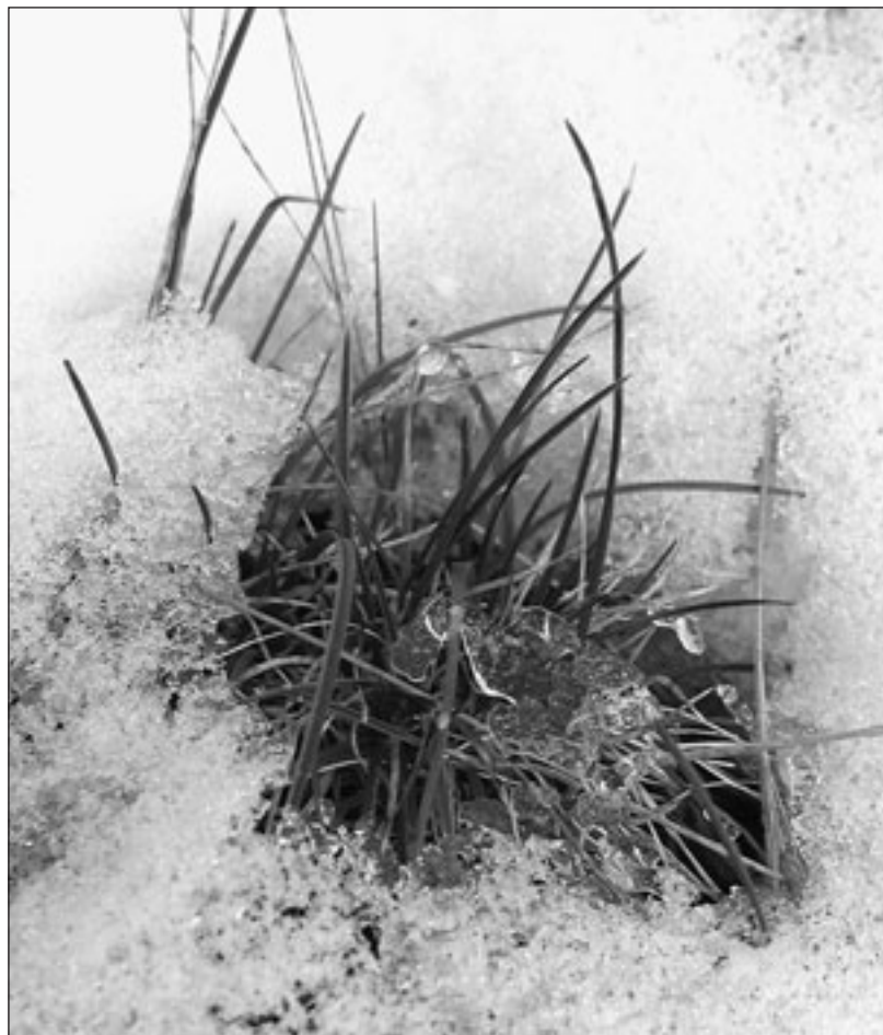
Poa secunda has periods of active leaf growth even during late fall and early winter. Photo taken November 25, 2010, at Ochoco Viewpoint State Park, Crook County, Oregon.

Sandberg bluegrass is a vital member of Oregon’s native flora. It’s a tough little tussock and serves as the native bunchgrasses’ last line of defense against