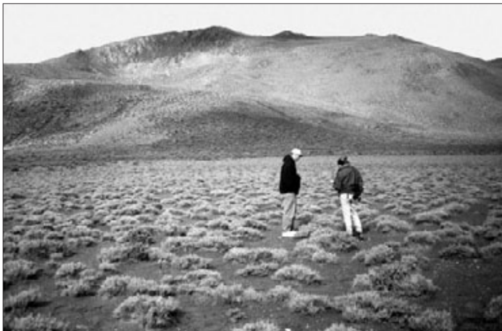
A flat near Fields dominated almost exclusively by winterfat ( Krascheninnikovia lanata ). Winterfat is a member of the Amaranth Family ( Amaranthaceae ) many of whose members are halophytic.

Having stocked up on provisions at the supermarket in Burns, we head south along Highway 205, and make a stop at Wright's Point, an inverted topography representing an ancient river bed filled with sediments, then lava, and now elevated by erosion of the surrounding softer