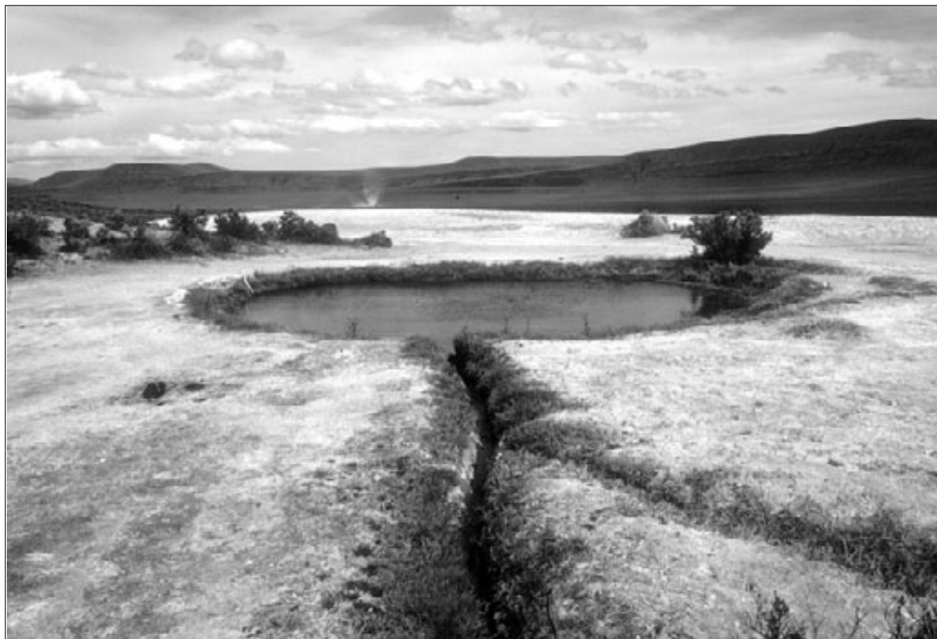
White crust indicative of saline soils at Mickey Hot Springs ACEC.

Twenty-two miles north of Fields, we stop at Pike Creek, ford the stream, and climb up on the hillside for a sweeping view of the Alvord Desert, a dry lakebed that is inundated in early spring and in wet years to form a shallow lake. The Desert itself is a remnant of the Pleistocene Alvord Lake that once extended 100 miles to the north and south. The Alvord is rimmed by geothermal features and, from the top of the hill, we look north toward Mickey Hot Springs, our next stop. On our climb back down the hillside, we spot ballhead waterleaf ( Hydrophyllum capitatum var. alpinus ) one