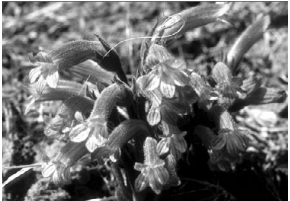
The clustered broomrape ( Orobancha fasciculata ) is parasitic on roots of sagebrush ( Artemisia tridentata ).