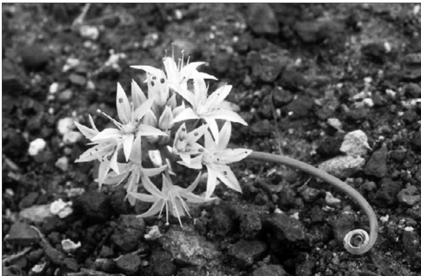
Lithosol with Nevada onion ( Allium nevadense ).