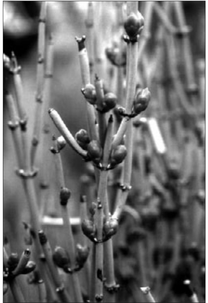
Clusters of "naked seeds," surrounded by bracts, at the stem nodes of green ephedra ( Ephedra viridis ).

Other students are surprised to notice a rather lush growth of mosses and lichens on rocky outcrops at this site. Despite the meager rainfall that falls along the eastern escarpment of Steens Mountain, such microhabitats provide opportunities for moisture to accumulate. Mosses that occupy such sites are ephemeral; by late spring, they desiccate and go dormant. For example, when dormant, the stiff silvery awns of Grimmia anodon reflect sunlight, and the black pigments found in its cell walls prevent unreflected