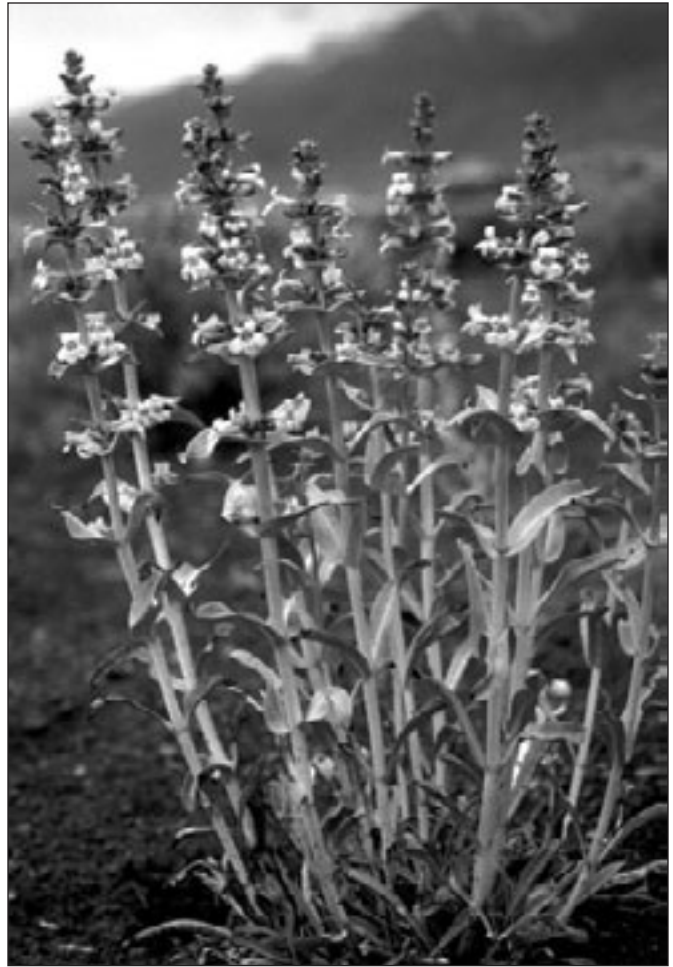
The glabrous and glaucous sharp-leaved penstemon ( Penstemon acuminatus var. latebracteatus ) growing on sandy soil near Mickey Hot Springs ACEC.

More questions arise: "Why do so many of the herbs seem to be buried in or under the shrubs?" The students have detected a pattern, an observation calling out for an explanation. Every sagebrush