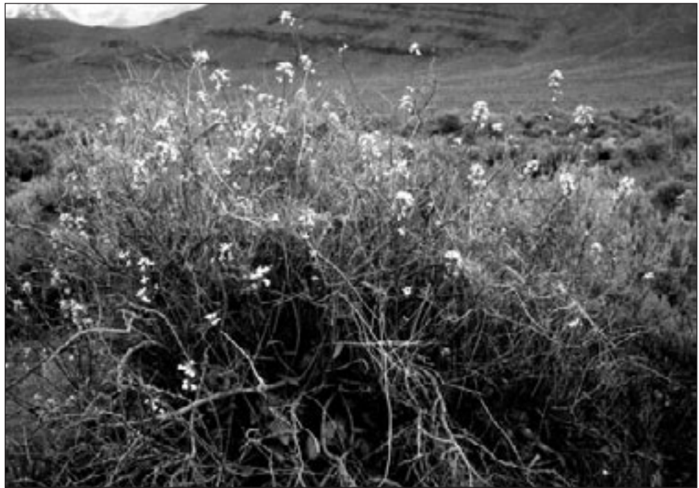
Stems of the weak thelypody ( Thelypodium flexuosum ) entwined within branches of a greasewood ( Sarcobatus vermiculatus ) at Mickey Hot Springs ACEC.

We walk a short distance south of the ACEC and find ourselves on a bare, hard surface that looks much like an exposed aggregate patio. Known as desert pavement, the surface is composed of small, densely packed and interlocking angular rocks on which few plants can take root. Several theories have been offered for how these pavements form, but the end result is that they minimize wind erosion in desert environments.