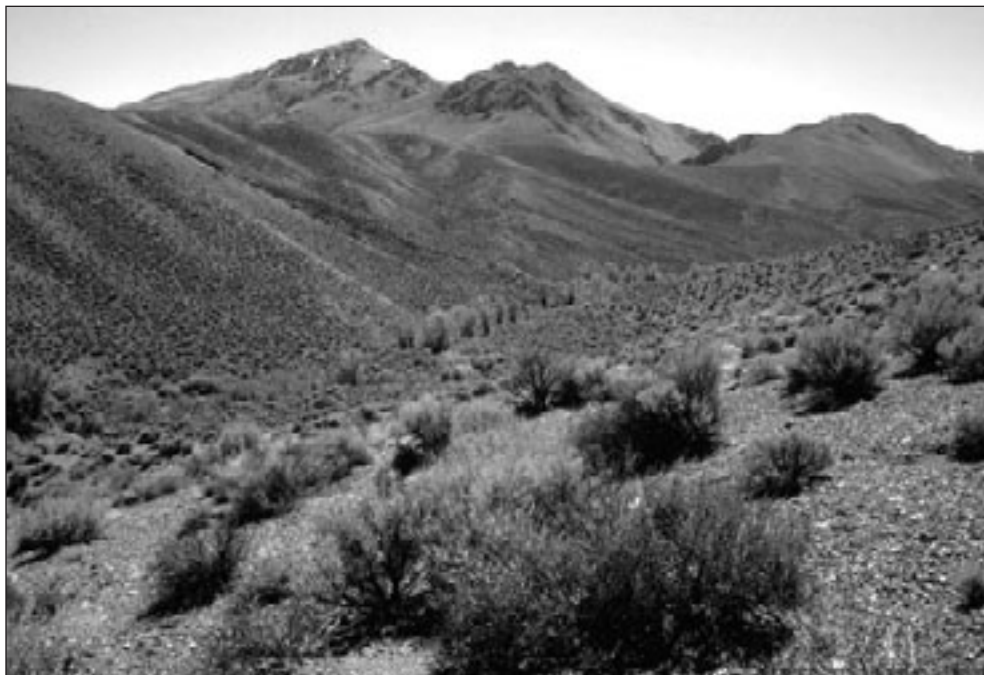
Riparian grove of narrowleaf cottonwood ( Populus angustifolia ) along Cottonwood Creek in the Pueblo Foothills RNA/ACEC.

sunlight from entering the cells. When the rains return in the fall, the awns relax, the pigment becomes transparent, and the plant begins to photosynthesize and reproduce. On closer inspection, we find mosses and lichens growing as epiphytes on shrub stems and on the ground beneath the shrubs as well.