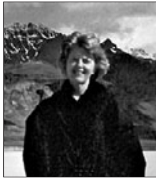
The author on the Alvord Desert with Steens Mountain (9,733 ft.) in the background.