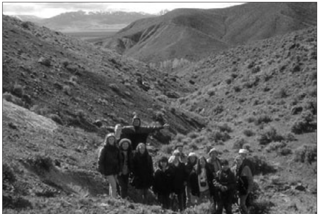
At the end of a hike up a draw above Cottonwood Creek at the Pueblo Foothills RNA/ACEC, students celebrate finding the desert pincushion ( Chaenactis stevioides ).

their host trees took her from the Sierra Nevada to the Rocky Mountains and Cascade Range. She and her students conducted plant ecological and systematics research in Arctic Alaska, in mountainous regions of the northwest, and in Willamette Valley wet prairies. Throughout her career, she led field trips to many beautiful places throughout the northwest, to the Swiss Alps, and to Costa Rica. She was co-founder of the Cheahmill Chapter of NPSO and served as its first president. Now retired, she enjoys taking art and other classes, hiking, rafting, and more. She is a certified yoga instructor and Master Gardener and now teaches botany and plant identification each year for the OSU Extension Master Gardener training class in Yamhill County.