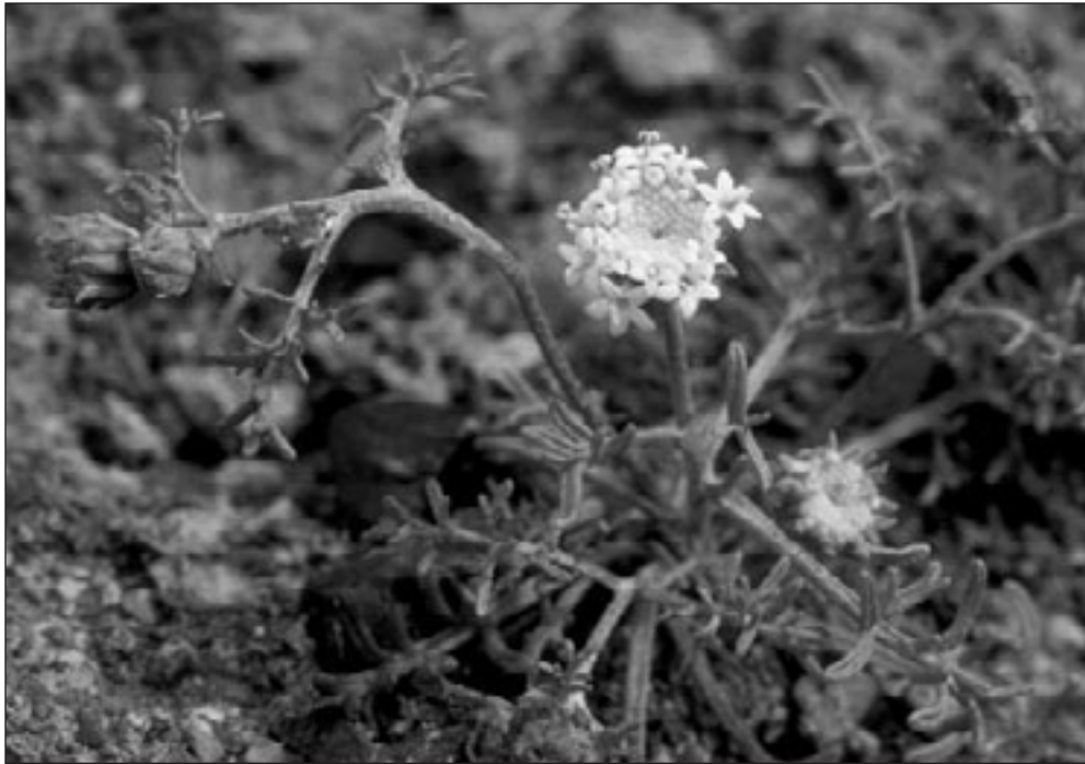
Desert pincushion ( Chaenactis stevioides ), a diminutive annual growing on a steep, rocky slope in the Pueblo Foothills RNA/ACEC.

our best to key them out. In this part of the state, until relatively recently, no flora was available to guide our efforts. The Flora of the Pacific Northwest (Hitchcock and Cronquist 1973) does not cover this part of the state, and The Jepson Manual (Hickman 1993) is good only in so far as the distributions of California species extend into Oregon. The publication of the Flora of Steens Mountain (Mansfield 2000) made identification of species much more reliable.