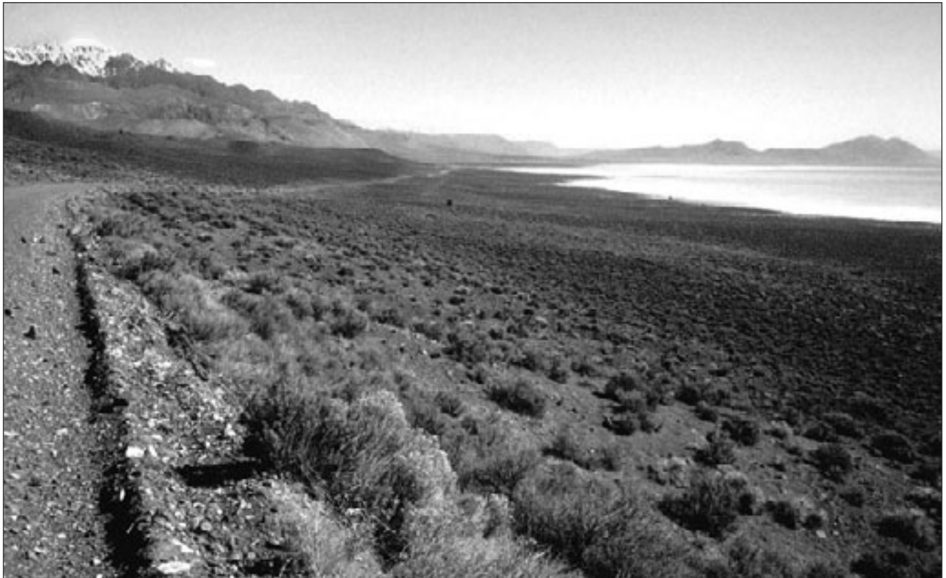
Steens Mountain and the western edge of the Alvord Desert from East Steens Road. The desert is a remnant of Alvord Lake that extended for 100 miles to the north and south during the Pleistocene.