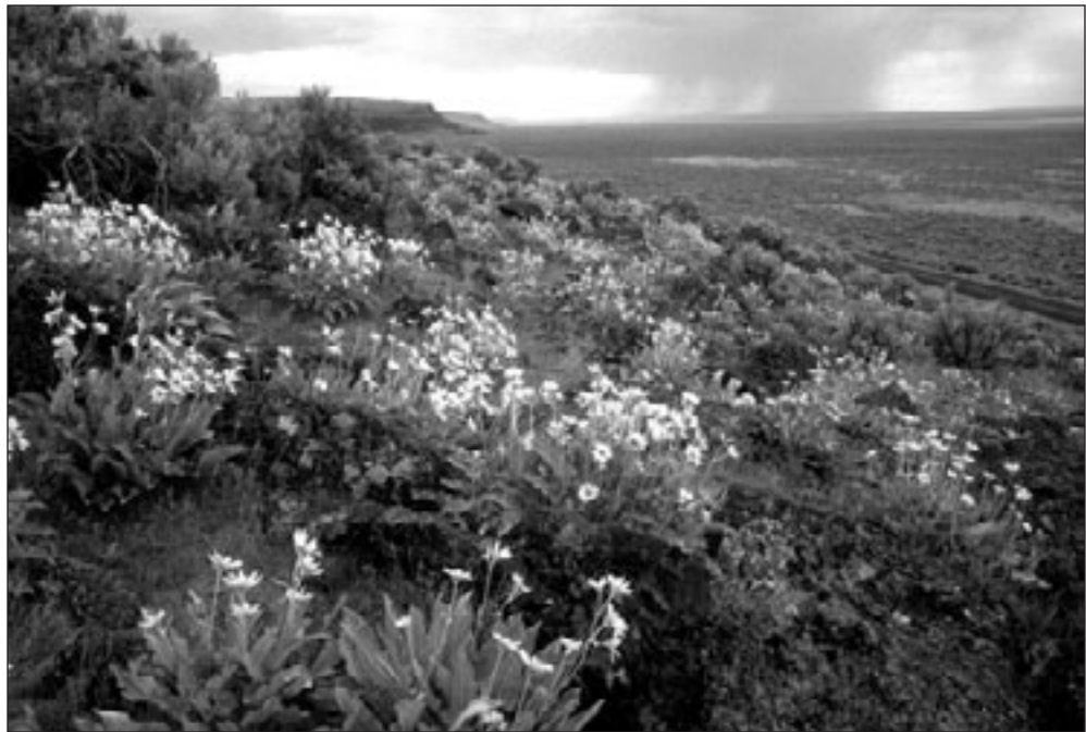
Catlow Valley with arrowleaf balsamroot ( Balsamorhiza sagittata ) growing on the Catlow Rim.

and rabbitbrush ( Ericameria and Chrysothamnus ). Amazing state, Oregon! All this diversity of landscape in our first day's drive from McMinnville.