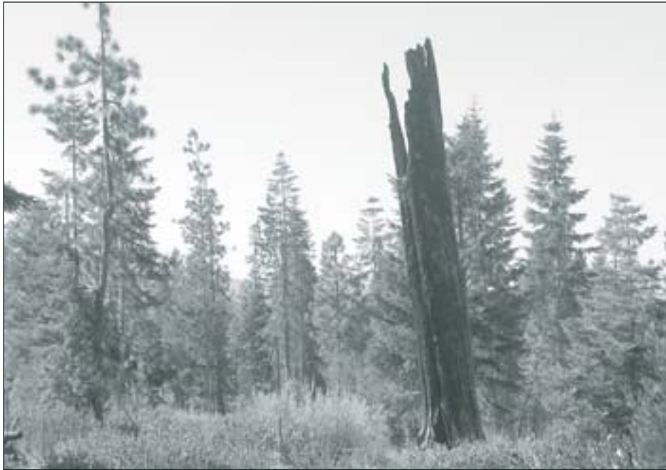
A charred snag is one of the few reminders of the previous forest. The young trees are Douglas fir and ponderosa pine; the shrubs are snowbrush ( Ceanothus velutinus ) and willow ( Salix scouleri ).

The sale included some 600,000 acres of timberland, plus mills, seed orchard, and nursery for a total price of $309 million. Rudey sold the Klamath Falls mill operations to Collins Pine Company. A year later US Timberlands made a public offering of shares in the company. The original offering was almost 7,500,000 shares at $21/share for a total of over $150 million. US Timberlands Company posted losses almost immediately, and in 2003 Rudey and his management group bought back the outstanding shares for $3/share (Timberland 2003). The shareholders had lost (and management had gained) over $130 million, and some of the unhappy shareholders sued, a suit as yet unresolved. The group of Rudey and others who had bought back the shares then organized themselves as The Inland Fiber Group. In 2006 they declared bankruptcy with $225 million in notes due in 2007.