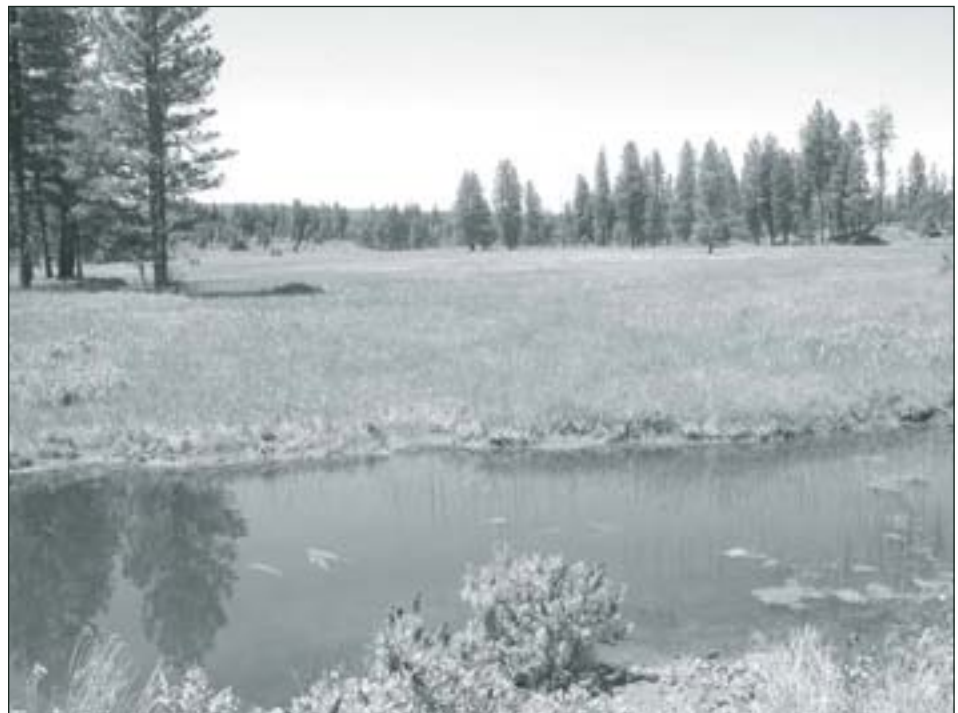
A typical Pokegama Plateau prairie in the spring. Several species of yampa ( Perideridia ) flower there in early summer, but by late summer the prairies have dried into cattle-trampled, sun-dried brick.

with a herd of elk that is growing in number. Surprisingly, a herd of wild horses also inhabits the Plateau. The Pokegama wild horse herd is thought to date to the early 1900s when a rancher turned loose a buckskin quarter horse stallion and some mares. Even though the herd is managed by the BLM, 80% of the land included in their horse management area is privately owned land (nearly all of it one-time Weyerhaeuser land). Under federal law, if the private landowner objected to the horses, the BLM would have to reduce the herd. The BLM management objective is to keep the