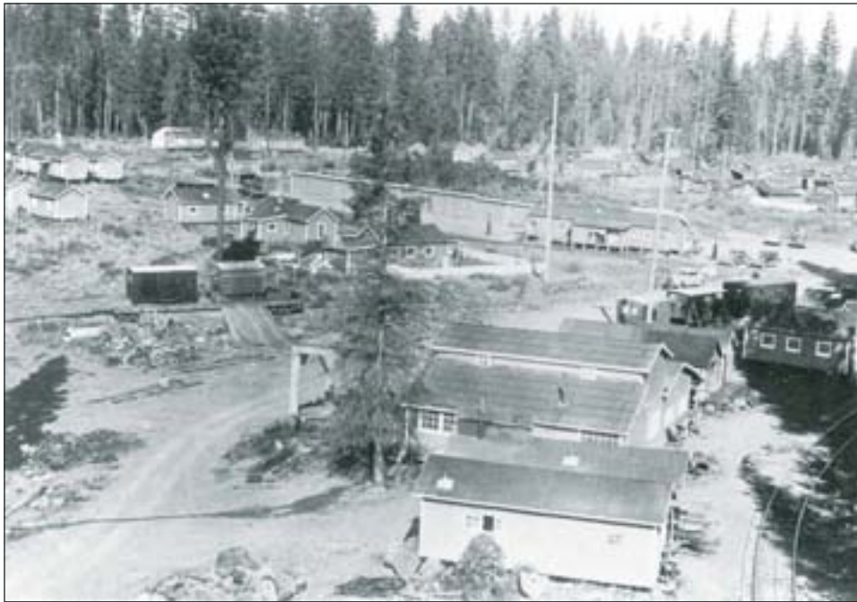
Camp #4 of the Weyerhaeuser Timber Company, about 1936. After an area had been logged out, the company moved the homes by rail to the next camp where they carefully placed them so that people had the same neighbors. Sometimes a house would be moved in the night with the family inside it, and at least once a school building was moved with the teacher and students inside.

months before the railroad was completed, a fire destroyed the mills and most of Klamathon, and the structures were never rebuilt. Currently, a marker near the Klamathon Bridge on the Klamath River is the only indicator of the former town.