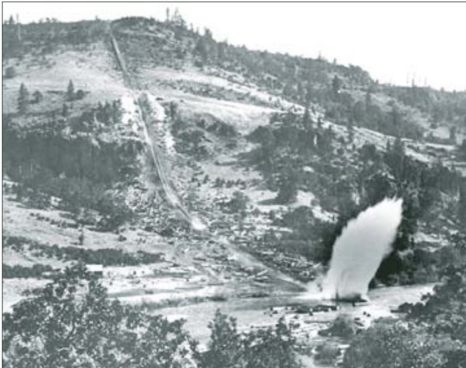
A log hits the Klamath River with a giant splash after its run down the Pokegama chute about 1900. The scar from the chute is still visible on the hillside today.

War II and partly because Weyerhaeuser Company would not build a sawmill until the area was served by two rail lines.