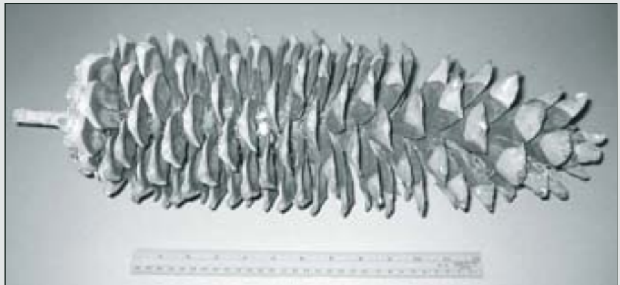
Among the pines, sugar pine has the longest cones.

Under previous conditions, sugar pine grew to enormous size, as the largest species in the genus Pinus . The Oregon champion near Gateway State Wayside in Josephine County is 217 feet tall and almost 6.5 feet in diameter. The largest known sugar pine in the world, 209 feet tall with a circumference of 435 inches, grows near Dorrington, California ( http://www.americanforests.org/resources/bigtrees/register ). Trees may live to be 400 to 500 years old. Not only is sugar pine the tallest of the pines, its cones are the longest, sometimes attaining a length of over 20 inches. Sugar pine is truly one of the greatest conifers of western North America (if not the world) in stature, usefulness, and colorful history, and its decline is a tragic loss. –Frank Lang