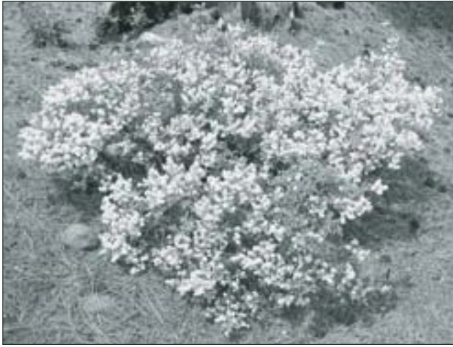
Whitethorn ( Ceanothus cordulatus ), noted for its rigid, spine-tipped twigs, grows in scattered locations on the Pokegama Plateau. Elsewhere, this shrub grows in such dauntingly impenetrable thickets that in 1908 the North Umpqua district ranger dubbed a ridge “Dread and Terror,” as he contemplated the prospects of fighting a fire in the whitethorn scrub.

been resolved, was vested in the US government. However, during the next hundred years, the federal government transferred title to nearly half of its Oregon lands to private ownership or to the new state of Oregon.