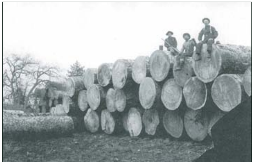
Peeled logs ready to be sent down the Pokegama log chute. Note that the ends are beveled to prevent the log end from splitting as it hit the water.

Finally, after 10 years of problems with sinking logs (sugar pine is heavy), low water, and fatalities as men unsnarled log jams in the river, the river run was replaced in 1903 by a 25-mile railroad from Klamathon up to New Pokegama on the Plateau. However, six