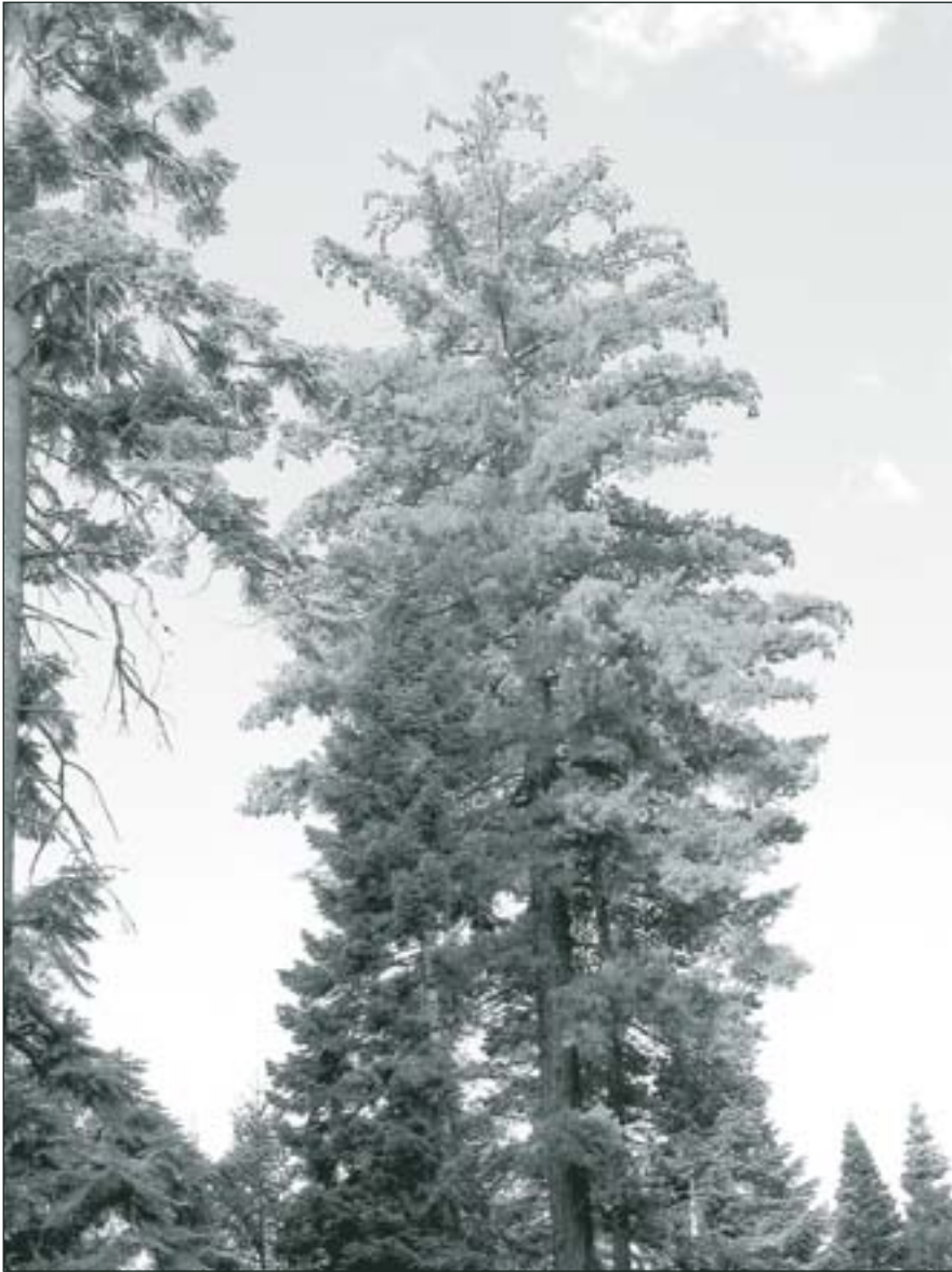
Ripe sugar pine cones dangle from the ends of branches in September. This tree and other individual sugar pine trees along Highway 66 are owned by the organization Friends of the Greensprings.

herd between 30 and 50 horses, so when the herd exceeded that limit, some horses were trapped and taken to the BLM wild horse facility at Burns for adoption by private owners.