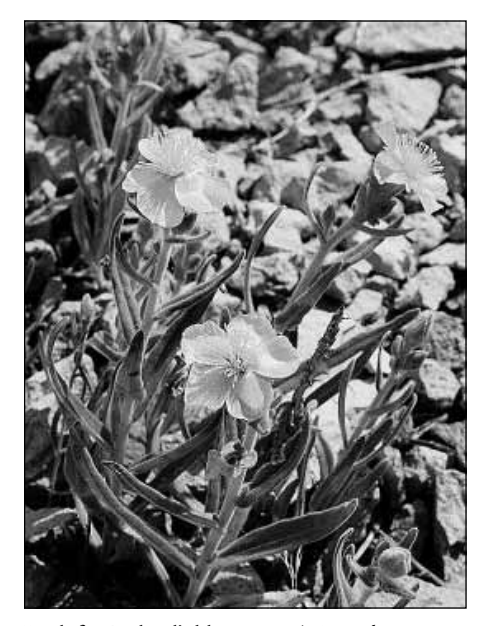
Look for Packard's blazingstar ( Mentzelia packardiae ) on greenish-yellow ash-tuff talus slopes.

Leslie Gulch has long attracted recreationists in search of a high quality outdoor experience. Elements of its attractiveness are its remote location with reasonable vehicular access and the opportunity to pursue outdoor recreation activities in a setting with relatively few human impacts. A single road through the canyon provides access to one of only five public boat launch sites on the 55 mile long Owyhee Reservoir. Most of the recreational use occurs