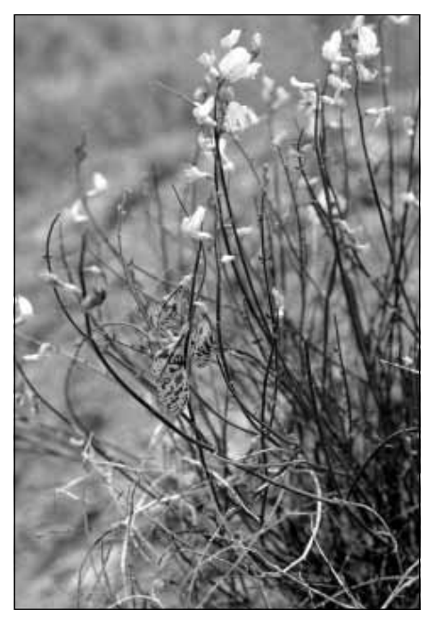
Barren milkvetch ( Astragalus cusickii var. sterilis), a regional endemic, grows on ash deposits.

Bald eagles, listed as threatened under the Endangered Species Act, winter along the Owyhee River corridor. Mountain quail, rare in Malheur County for many years, were last observed in the county in 1981, in Leslie Gulch ACEC. Other rare animal species include Townsend's bigeared bat, Mojave black-collared lizard,