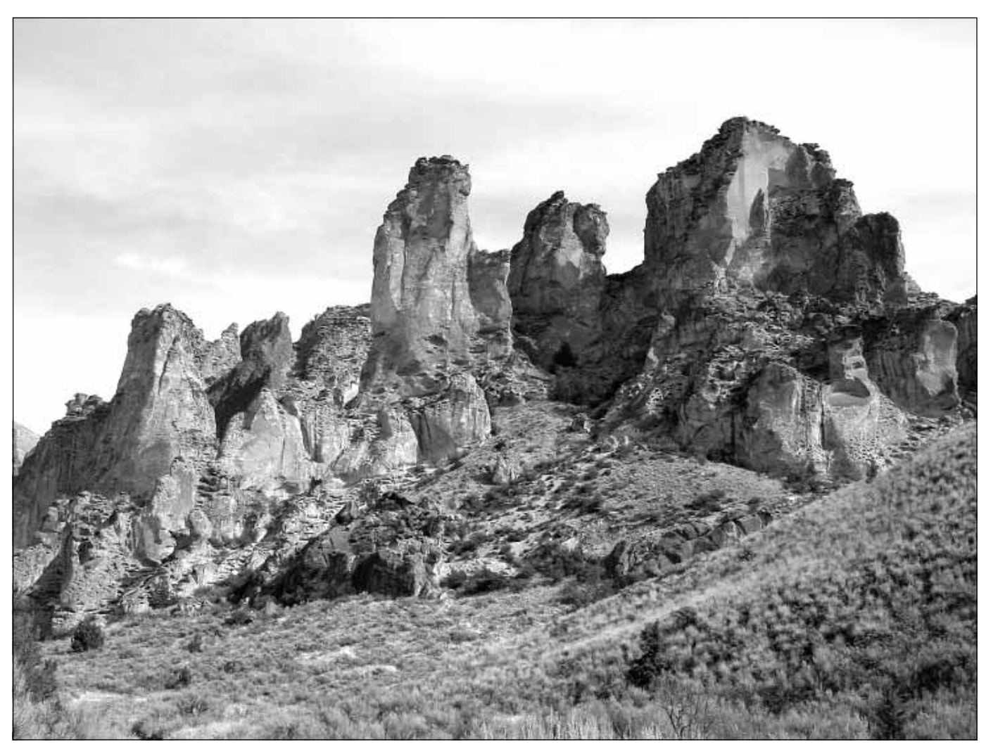
Main canyon of Leslie Gulch.

The violent explosions, the Mahogany Mountain caldera spewed hot volcanic gases, volcanic ash, and large chunks of volcanic rock in a molten froth more than 1,000 feet thick over several thousand square miles. Thus began the formation of the rosy golden cliffs of Leslie Gulch 15 million years ago, with a rhyolite pyroclastic flow. As the deposit cooled and lithified into rock, trapped gases created pockets. These cavities and differential weathering of the Leslie Gulch Ash Flow Tuff created spectacular, almost eerie, landforms that include "honeycombs" and skyline windows.