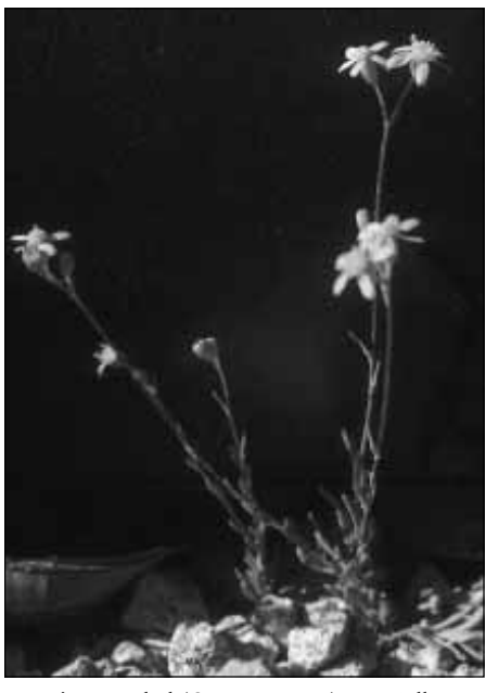
Ertter's groundsel ( Senecio ertterae) is a Malheur County endemic.

less distinctive ash deposits throughout the region. Three uncommon regional endemics, Packard's wormwood (Artemisia packardiae), Mackenzie's phacelia (Phacelia lutea var. mackenzieorum ) and false naked buckwheat (Eriogonum novonudum), find habitat in the canyons and bluffs of the ACEC. Oregon lists Packard's blazingstar and barren milkvetch as threatened, and grimy mousetail