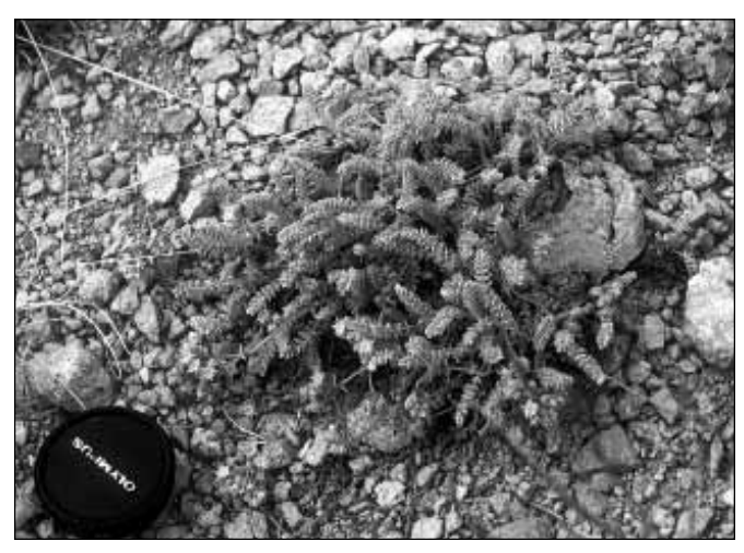
Grimy mousetail ( Ivesia rhypara var. rhypara ) grows over shallow, apricotcolored ash.

Approximately 85% of the ACEC has been designated as Wilderness Study Area (WSA). The specific wilderness values identified include outstanding opportunities for solitude, primitive and unconfined recreation, a high degree of naturalness, spec-