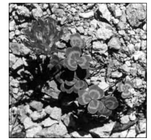
Owyhee clover ( Trifolium owyheense) is the most spectacular of the rare species.