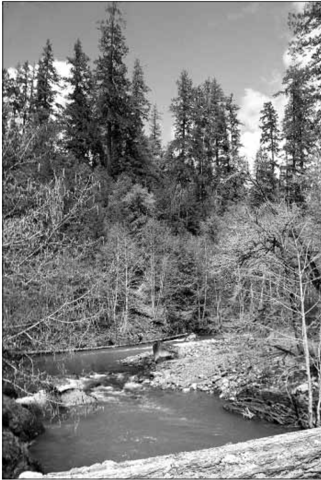
Riparian woodland of Port Orford cedar, Douglas fir, red alder, bigleaf maple, California laurel, and tanoak along the North Fork of Hunter Creek.

( Pleurospora fimbriolata ), evergreen everlasting ( Antennaria suffrutescens ), brook wakerobin ( Trillium rivale ), fairy slipper ( Calypso bulbosa ), silky horkelia ( Horkelia sericata ), golden iris ( Iris innominata ), giant chainfern ( Woodwardia fimbriata ), Oregon fawnlily ( Erythronium oregonum ), Del Norte pea ( Lathyrus delnorticus ), and Scouler's woollyweed ( Hieracium scouleri ).