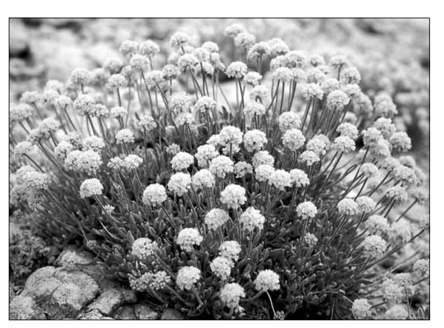
Pin cushion-like Crosby's buckwheat (Eriogonum crosbyae) ablaze with yellow flowers.

1978 and named Eriogonum crosbyae (Reveal 1981). Crosby's buckwheat is limited to southwestern Harney County and southeastern Lake County, Oregon, and Washoe County in northwestern Nevada, Like several other rare buckwheats in Lake County, Crosby's buckwheat is restricted to white tuffaceous ash flow soils that are stratified with rhyolite. Although there is little competition from other plants in this environment, plants must survive the rigors of intense sun without a protective canopy, nutri-