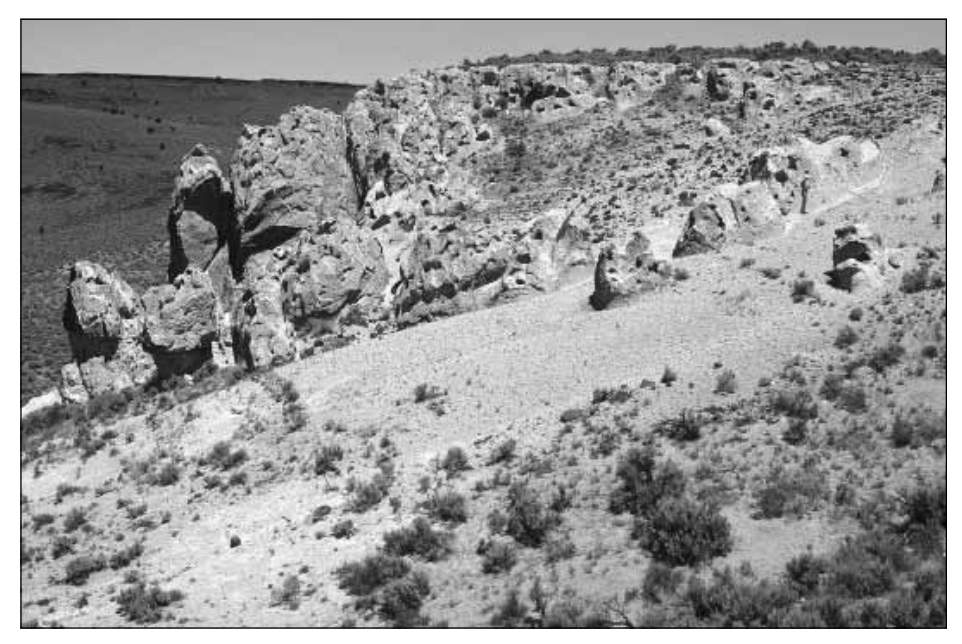
Grimy ivesia ( Ivesia rhypara var. rhypara ) grows on a steep hillside of vitric ash flow pumice.

Elevation within the RNA ranges from 5,300 to 5,980 feet. The climate is arid, with average precipitation less than ten inches per year, falling mainly as snow in the winter (January) and rain in spring (May). The geology of the RNA is spectacular; the lower reaches of Guano Creek cut through Tertiary-age tuffaceous and pumiceous sedimentary rock and locally welded tuffs. Faulting in