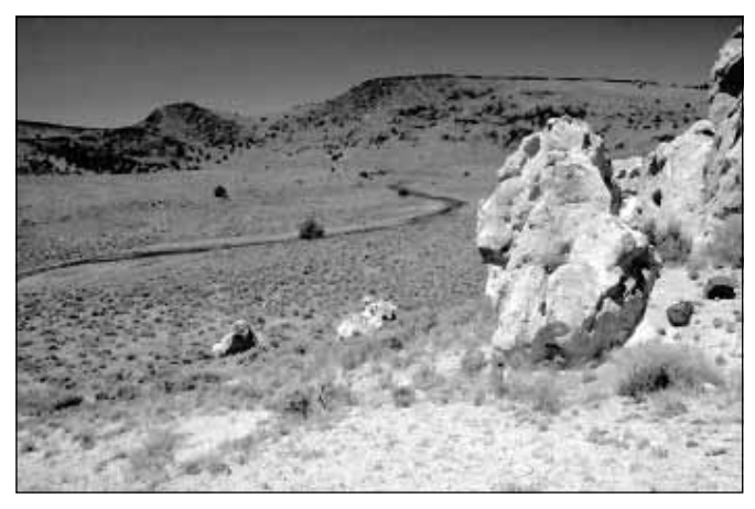
Guano Creek winds six miles through lava banks and white pumice hills to reach the broad, open Guano Valley.

( Perideridia spp.), wild iris ( Iris missouriensis ), various sedges, silver sagebrush ( Artemisia cana ), and basin wildrye ( Leymus cinereus ) grow on the valley floor with fringed water-plantain ( Damasonium californicum ) in the flowing stream; all contribute to the rich diversity of the plant community. Several species were used by Native Americans in the past and are "cultural plants" protected under Tribal Trust Responsibilities (Forest Service and BLM 1995). These plants are indicated in the species list by #.