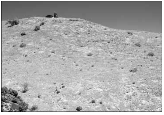
Crosby's buckwheat is restricted to white tuffaceous ash flow soils that are stratified with rhyolite.

near the Crosby's buckwheat site. A tiny cushion-shaped member of the rose family, its small flowers are white petals on a yellow "cup." It grows in four long shallow cracks that cross the ash flow hillside. The only other population of grimy ivesia in Oregon is in Malheur County (see article about Leslie Gulch on page 3). Disjunct populations occur in Washoe and Elko counties, Nevada (Kaye and others 1991). Grimy ivesia is a BLM Bureau sensitive species and on ONHP List 1. The Guano Creek area was closed to grazing in 1994, when livestock trampling reduced the ivesia to 28 indi-