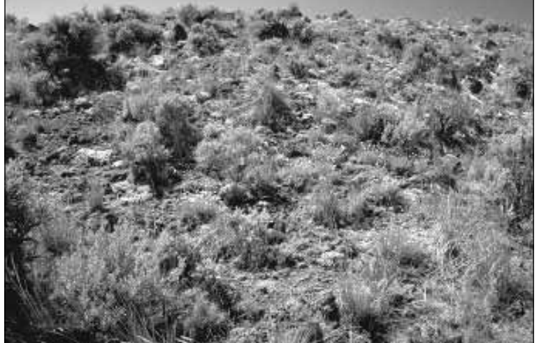
Low sagebrush grasslands on the surrounding uplands display a variety of wild flowers in May and June.