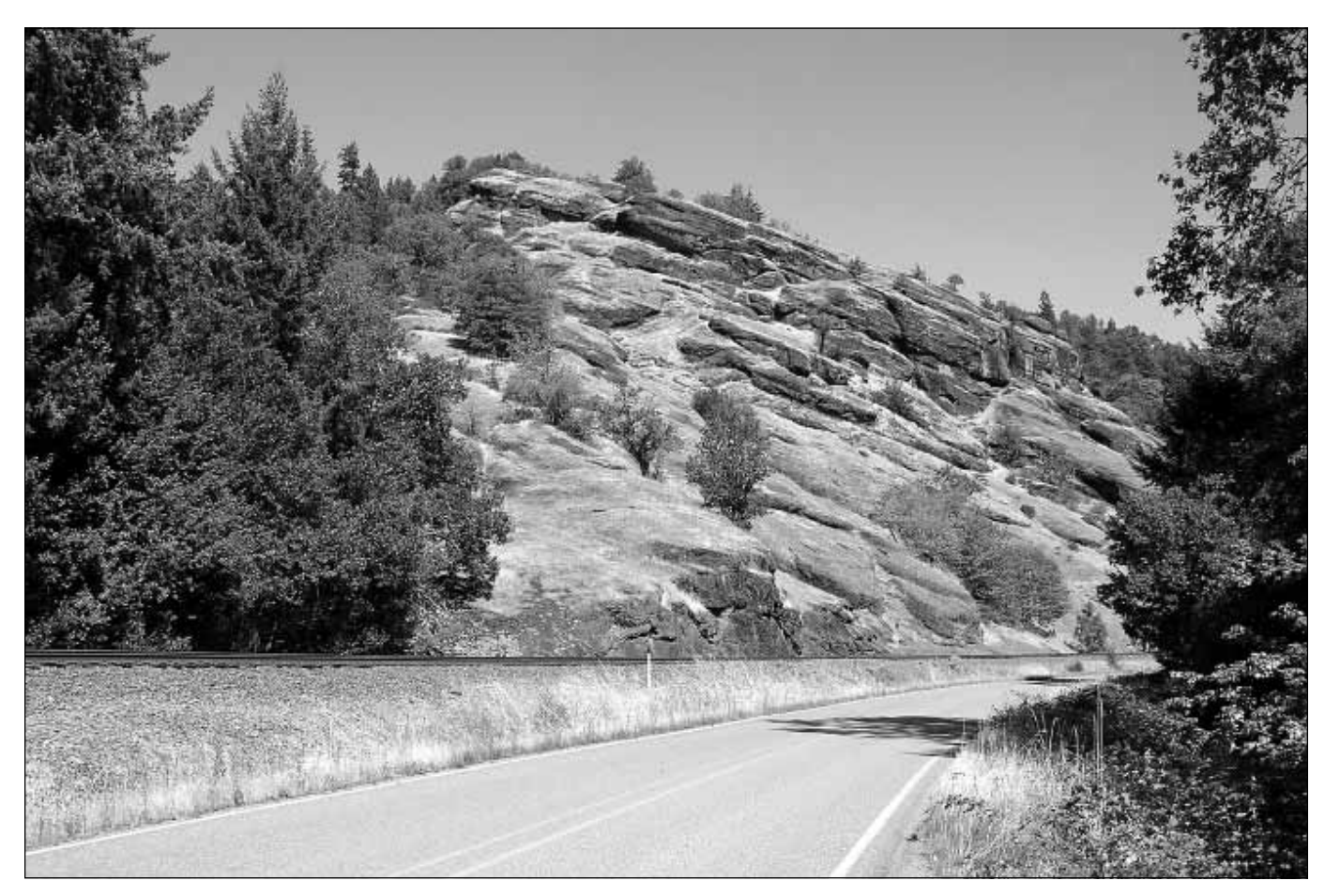
Beatty Rocks as viewed from Cow Creek Road.