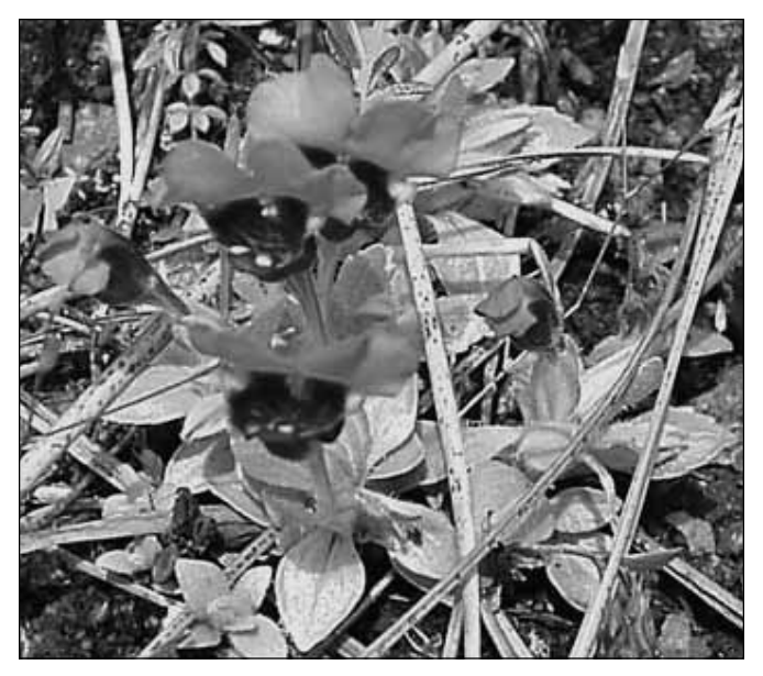
Douglas monkeyflower (Mimulus douglasii).

California sandwort grows on nearly bare soils on open slopes or ridges in the Jeffrey pine and shrub associations. California sandwort is a small plant with five-petaled flowers. It can be