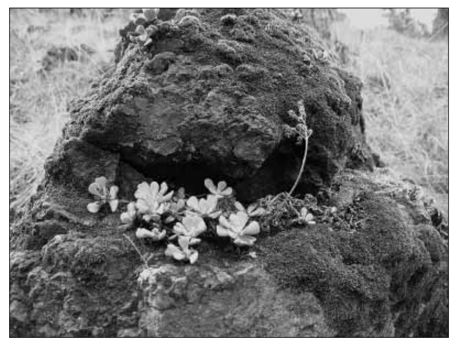
The rare moss, Pseudoleskeella serpentinensis , surrounds spatula leaf stonecrop ( Sedum spathulifolium ) on a serpentine rock outcrop. Photo by Susan Carter.

at the Hanna Nickel Mine, approximately two and a half miles northeast of Beatty Creek RNA. Compounding the unfavorable mineral composition, these soils are highly erodible, and have low moisture availability, resulting in a harsh environment for plants. As a result, serpentine habitats have led to a specialized native flora, a high level of endemism, and a relative lack of invasion by nonnative plants.