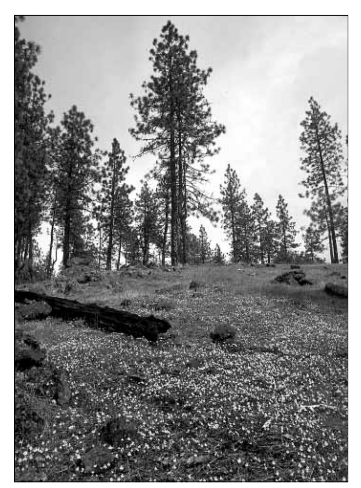
Jeffrey pine savanna.

The riparian community flanks Beatty Creek as a narrow band of mixed evergreen forest (Zika 1987). Tree species include Douglas fir, incense cedar, Port Orford cedar, Oregon ash ( Fraxinus latifolia ), big leaf maple ( Acer macrophyllum ), Pacific yew ( Taxus brevifolia ), California laurel, and alder ( Alnus rubra ). Shrubs include western azalea ( Rhododendron occidentale ), ocean spray, and poison oak. Port Orford root rot ( Phytophthora lateralis ) has not been observed anywhere in the drainage.