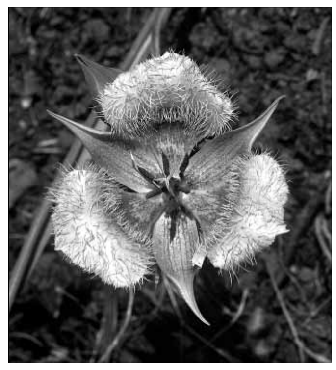
Crinite mariposa lily ( Calochortus coxii ) is a rare serpentine endemic.

association includes Port Orford cedar ( Cupressus lawsoniana ) in the overstory and California laurel ( Umbellularia californica ) in the understory. Both of these species occur here at the eastern edge of their range in Oregon. Populations of seven special status species occur within the RNA and there is potential habitat for the serpentine endemic, crinite mariposa lily ( Calochortus coxii ), on the recently acquired addition to the RNA.