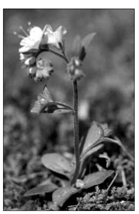
Spring phacelia ( Phacelia verna ) grows among the moss on marine conglomerate outcrops, with a sparse cover of grasses and forbs.

Serpentine areas in the acquired parcel are potential habitat for crinite mariposa lily, an endemic species restricted to serpentine sites in Douglas County (State