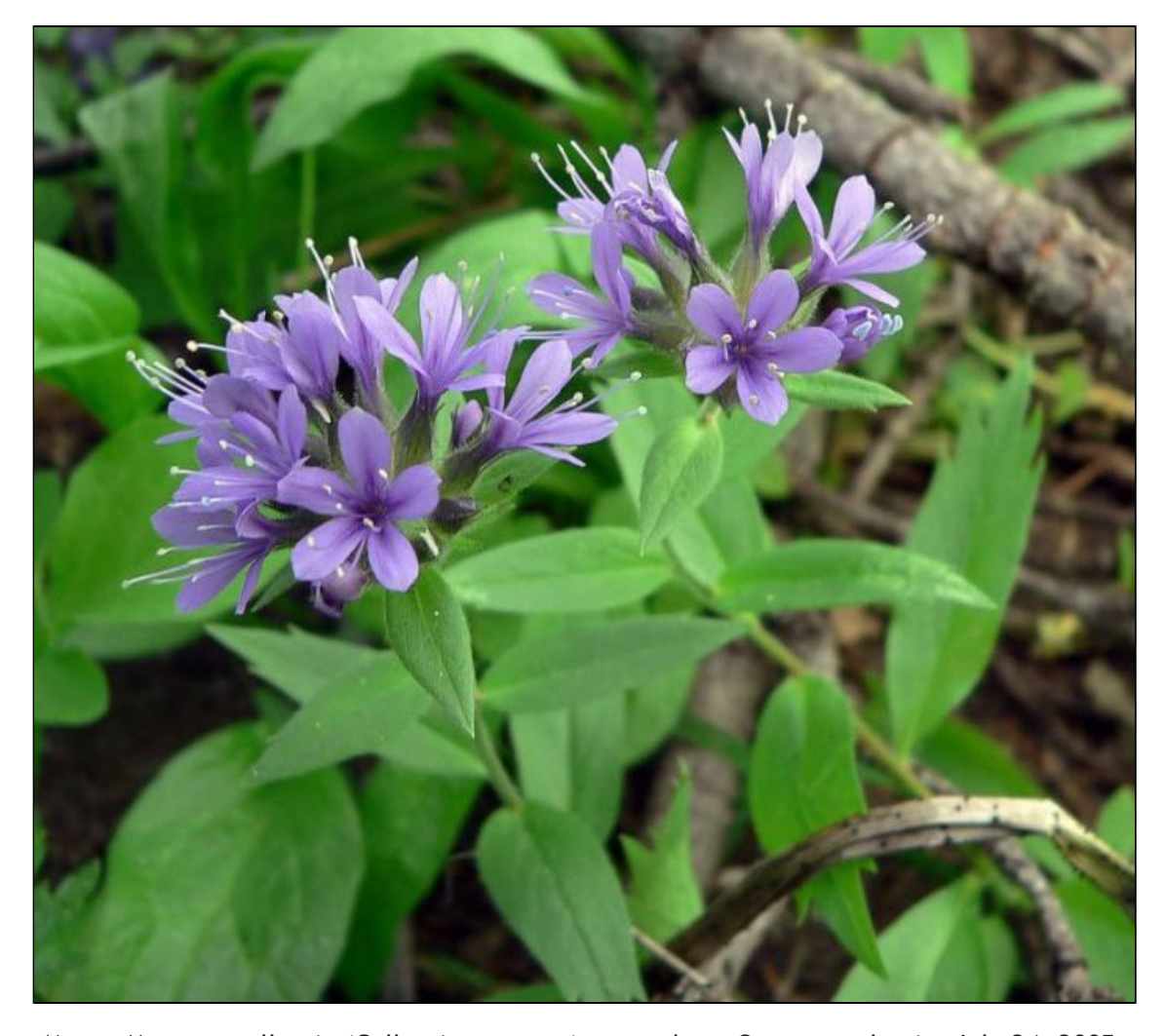
Mount Mazama collomia (Collomia mazama), a southern Oregon endemic. July 24, 2005.

Celebrate the 50th anniversary of the Endangered Species Act (ESA) by adopting a rare plant species. Through our southern Oregon community (citizen) science project, we will teach volunteers how to monitor populations of rare plant species. The goal is for volunteers to be able to visit known populations of their adopted species and report on the health of those populations. After completing the training, volunteers will work independently or with a team of family and friends as they check on their adopted plants over time.