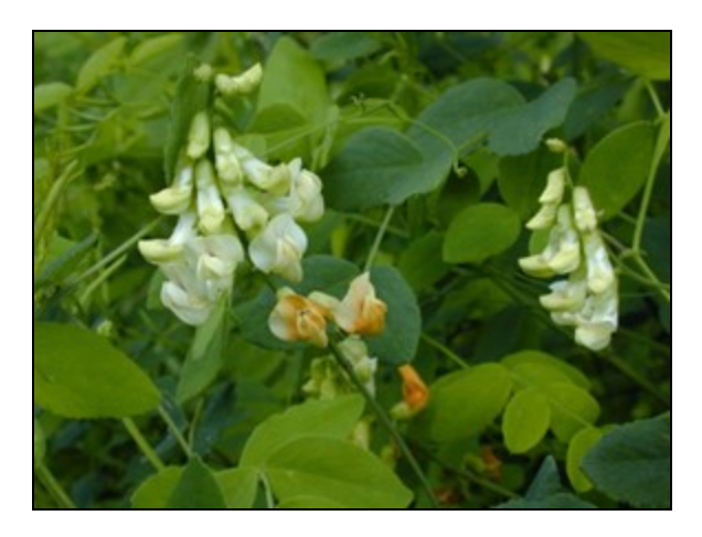
Thin-leaved peavine ( Lathyrus holochlorus). Lane County, Oregon. May 18, 2003.

ODA anticipates completing partner review, TAC review, and drafting of the amended rule sometime this winter (2022/2023) with notification of the public to occur as early as January or February 2023. Given this timeline, the state list update could be completed by as early as Spring 2023.