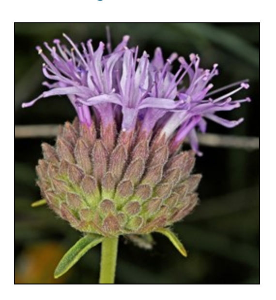
Narrow-leaved monardella ( Monardella angustifolia ). Malheur County, Oregon. June 4, 2016.

These include Lemmon's milkvetch (Astragalus lemmonii), Stansell's fleabane (Erigeron stanselliae), Ochoco lomatium (Lomatium ochocense), barren valley collomia (Collomia renacta), Hitchcock's blue-eyed grass (Sisyrinchium hitchcockii), narrow-leaved monardella (Monardella angustifolia), Willamette navarretia (Navarretia willamettensis), white meconella (Meconella oregana), seaside gilia (Gilia millefoliata), and thin-leaved peavine (Lathyrus holochlorus). Photos and technical descriptions for these species can be found on the Oregon Flora website.