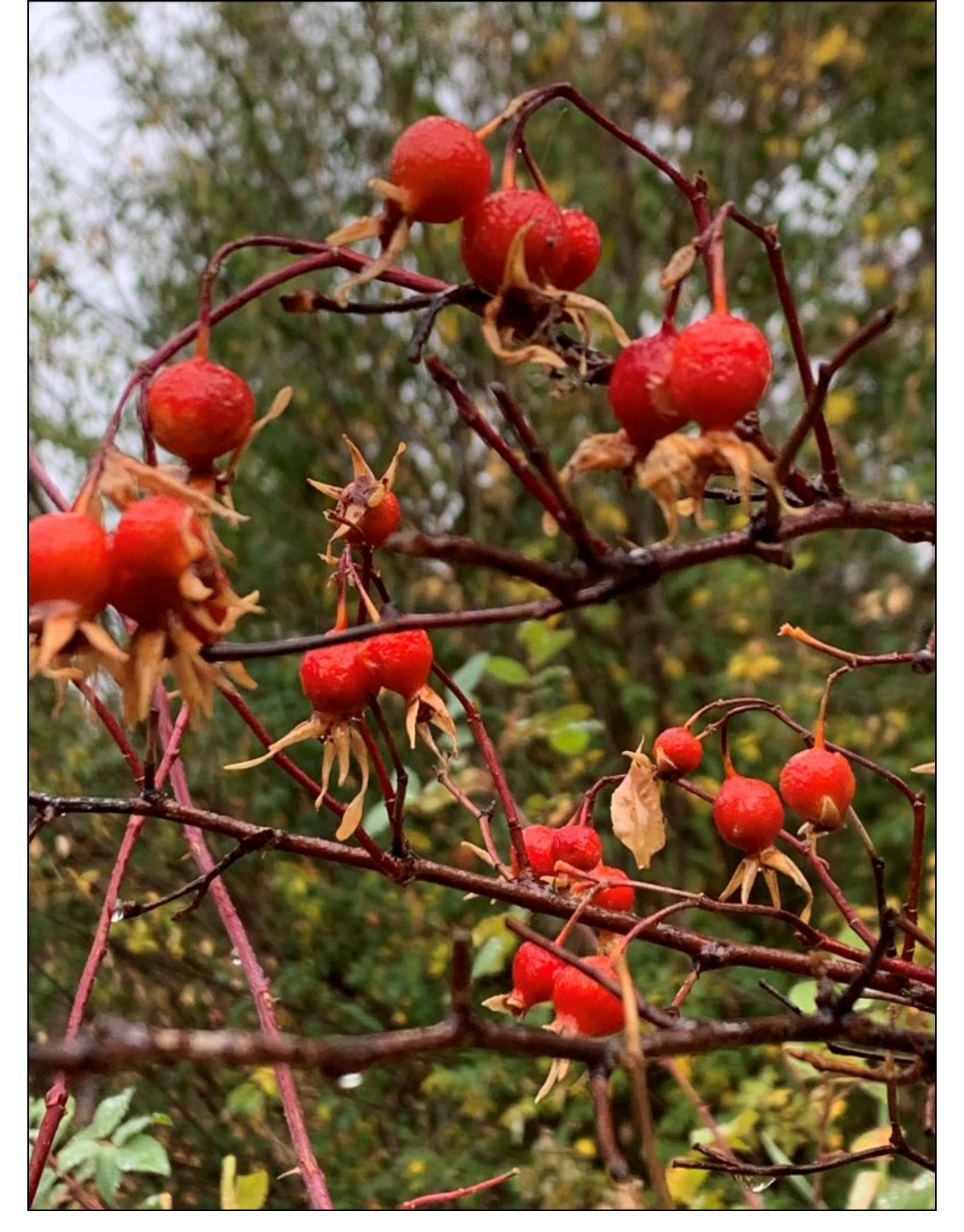
Rose hips (Rosa sp.)

Ochoco Mountains, Oregon, October 22, 2022.