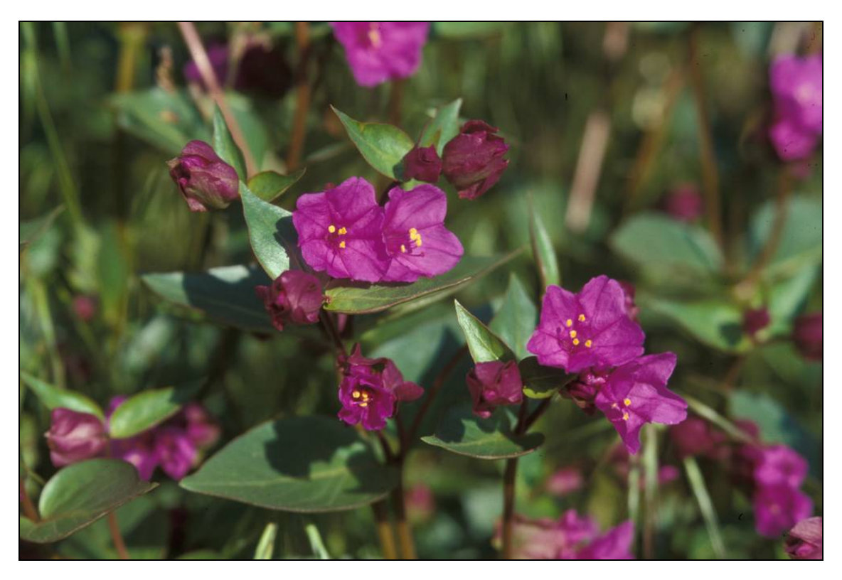
MacFarlane's four o' clock ( Mirabilis macfarlanei ). Listed as endangered under federal and Oregon ESAs. Wallowa County, Oregon.

When one or more of these factors imperils the survival of a species, the USFWS takes action to list the species as endangered or threatened to ensure the appropriate protective measures apply. Using these factors, the USFWS also assesses species already listed to determine whether they should be reclassified from threatened to endangered and whether threats have been reduced or eliminated to the point the species should be reclassified from endangered to threatened or removed from the list.