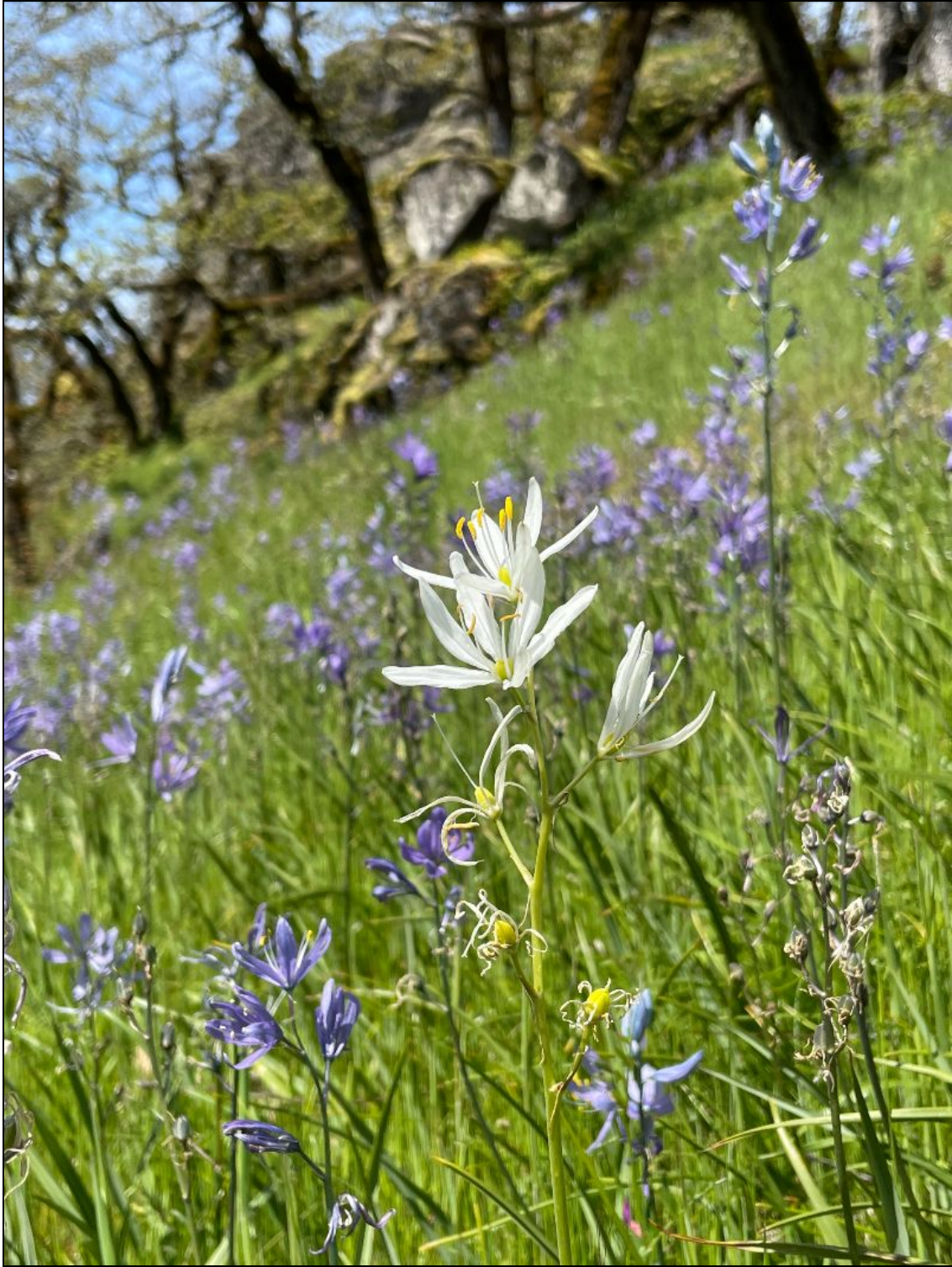
Camas ( Cammassia quamash) white variant, Columbia Gorge.