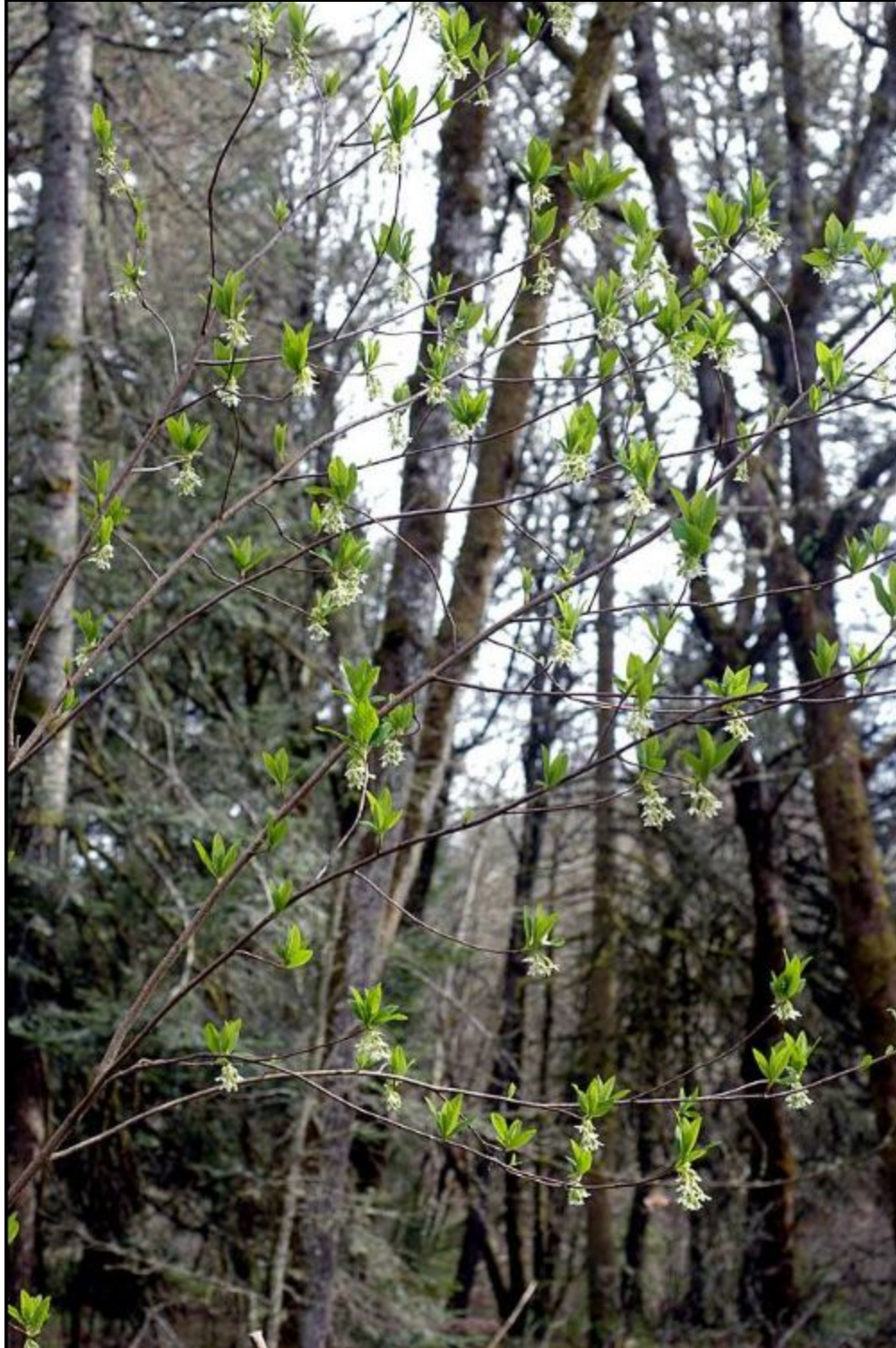
Oso berry (Oemleria cerasiformis)

Benton County, Oregon, March 2008.