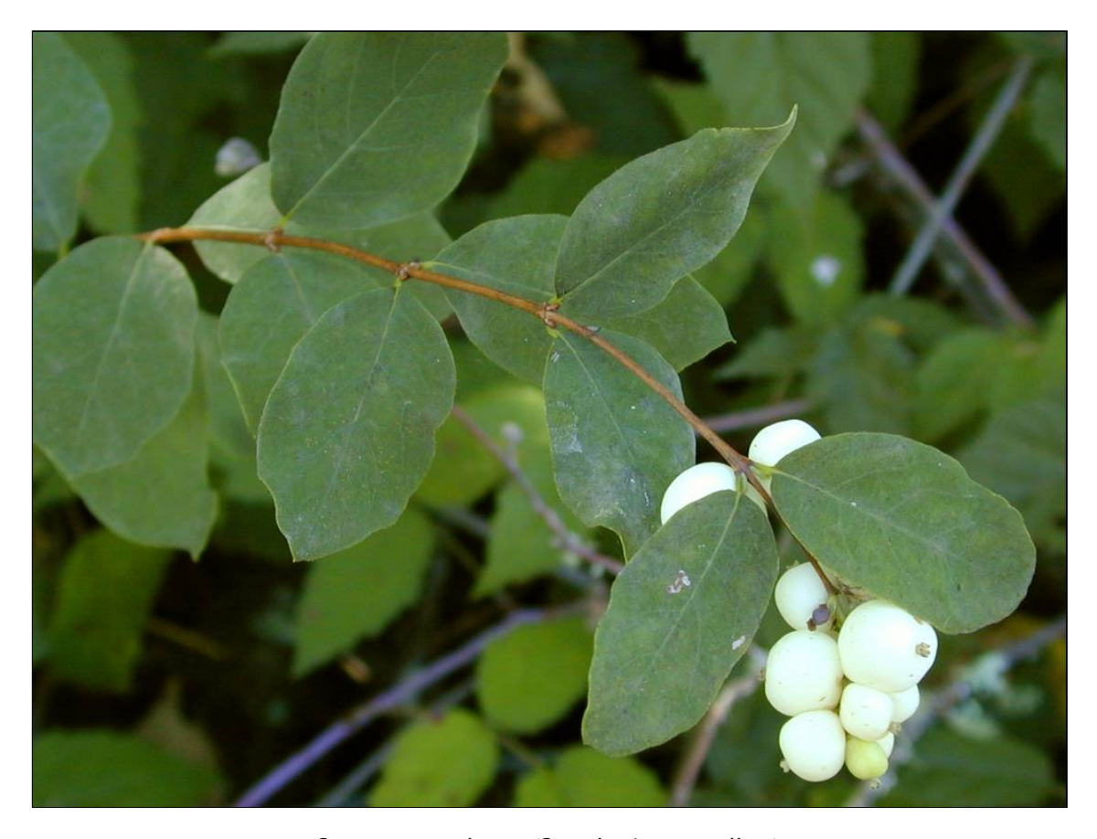
Common snowberry (Symphoricarpos albus)

December 2021/January 2022 Volume 54, No. 10