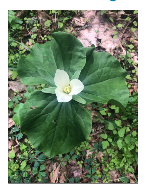
Erythronium hendersonii (left) and Trillium albidum (right)

Althouse Nursery, <u>althousenursery.com</u>