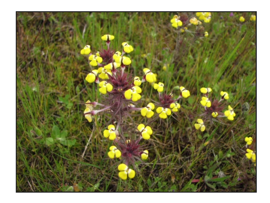
Johnny tuck AKA butter-and-eggs ( Triphysaria eriantha ssp. eriantha ) Orobanchaceae

This annual herb is widespread in California but, in Oregon, it is restricted to the extreme southwestern corner of the state. For example, it is common in Jackson County, especially on the west side of Interstate 5 near the Central Point north exit, which is where these images were taken. It grows in shallow soils in very open habitat and is an early bloomer (images taken 11 April 2010). This native is characterized by a hairy purple stem and a spike of flowers, each with a thin, purple upper lip and a wide lower lip divided into three white and yellow pouches. It is a facultative root parasite, gaining nutrients through haustoria attached to the roots of other plants.