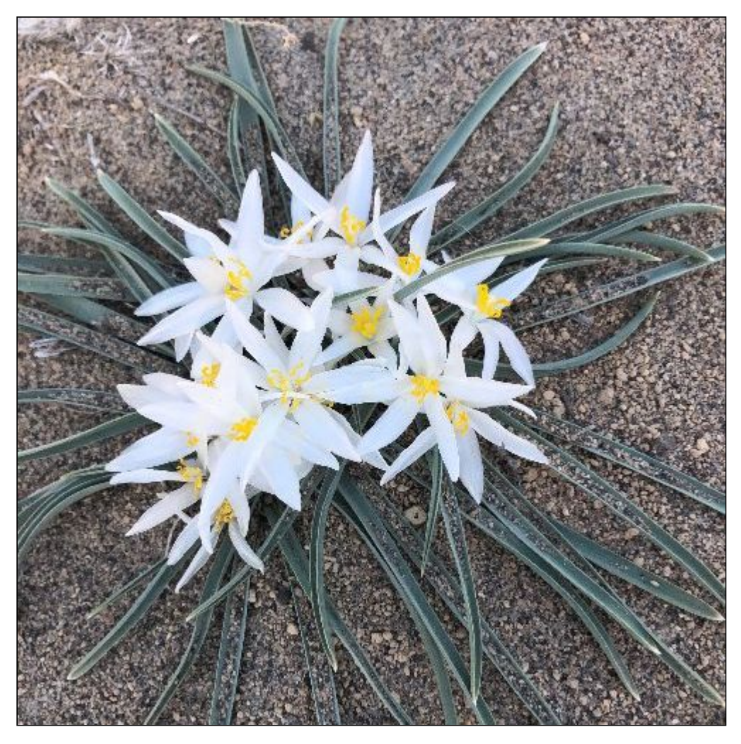
Leucocrinum montanum, sand lily.

Dedicated to the enjoyment, conservation, and study of Oregon's native plants and habitats May 2020 Volume 53, No. 4