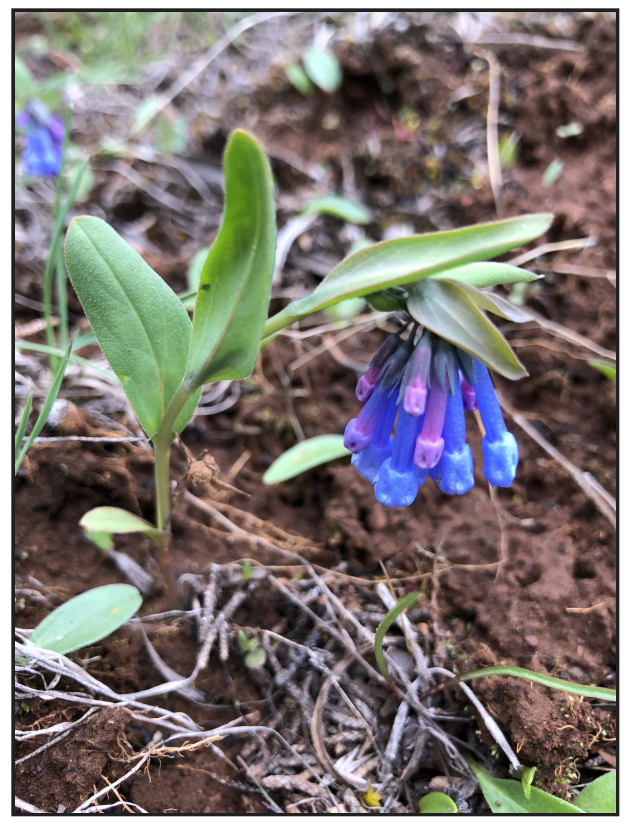
Long-flowered bluebells (Mertensia longiflora) in the Borage family