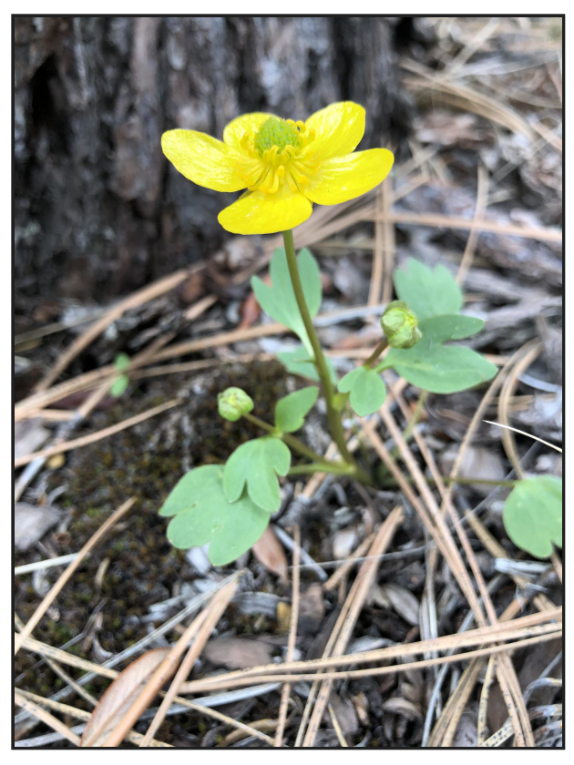
Sagebrush buttercup (Ranunculus glaberrimus) in the Buttercup family