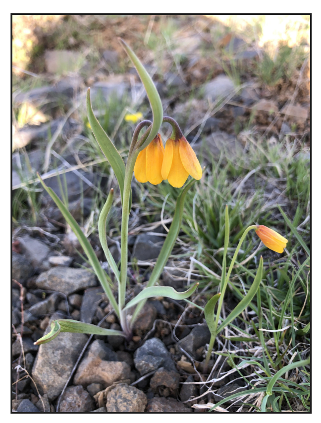
Yellow bells (Fritillaria pudica) in the Lily family