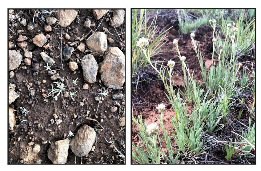
Flagellate pussytoes ( Antennaria flagellaris ) and narrowleaf pussytoes ( Antennaria stenophylla ) in the Aster family