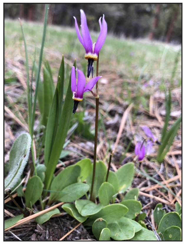
Desert shooting star (Dodecatheon conjugens) in the Primrose family