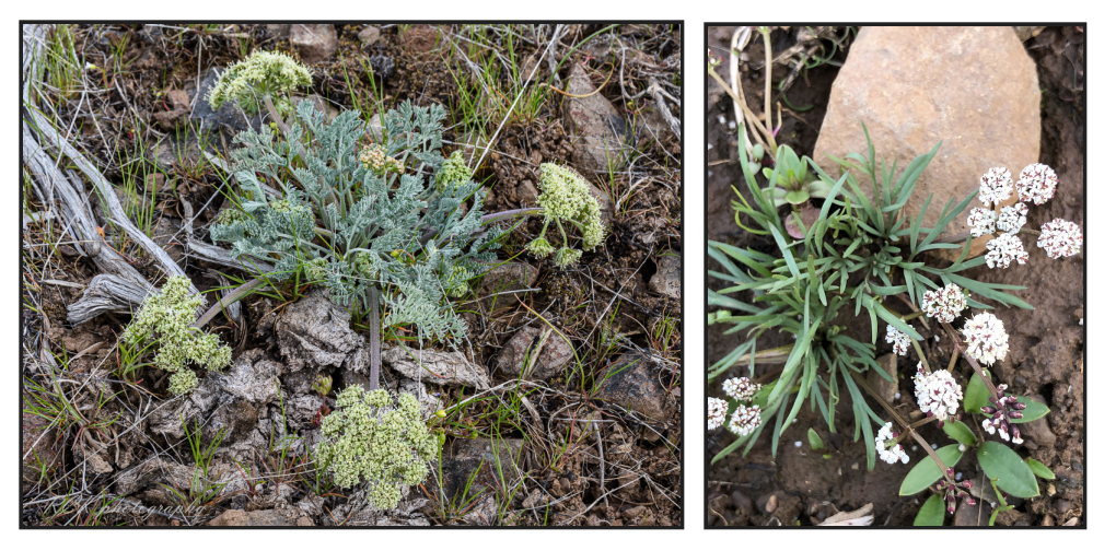
Large fruit lomatium (Lomatium macrocarpum) and salt and pepper (Lomatium gormanii) in the Parsley family