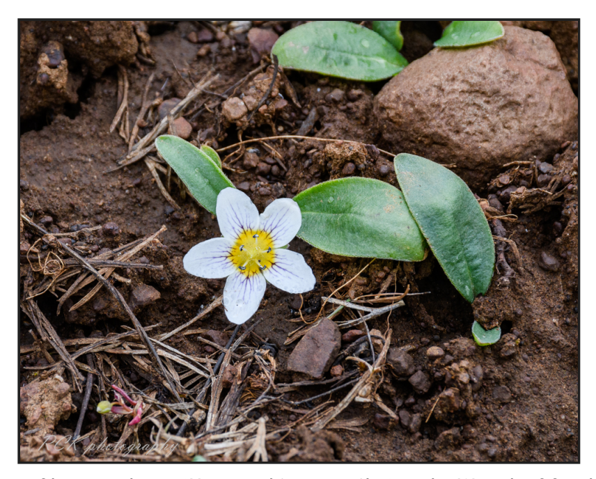
Dwarf hesperochiron (Hesperochiron pumilus) in the Waterleaf family