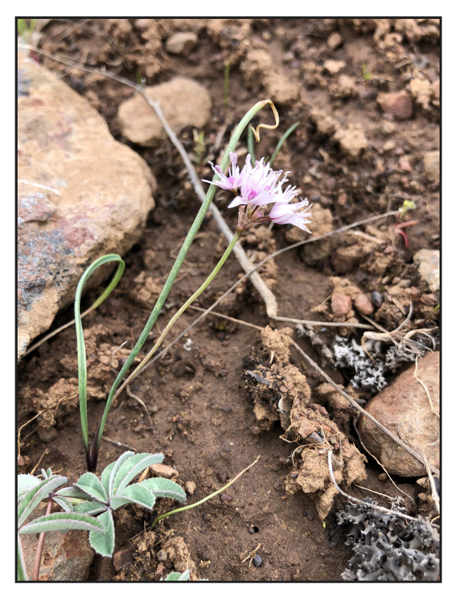
Rock onion (Allium macrum) in the Amaryllis family