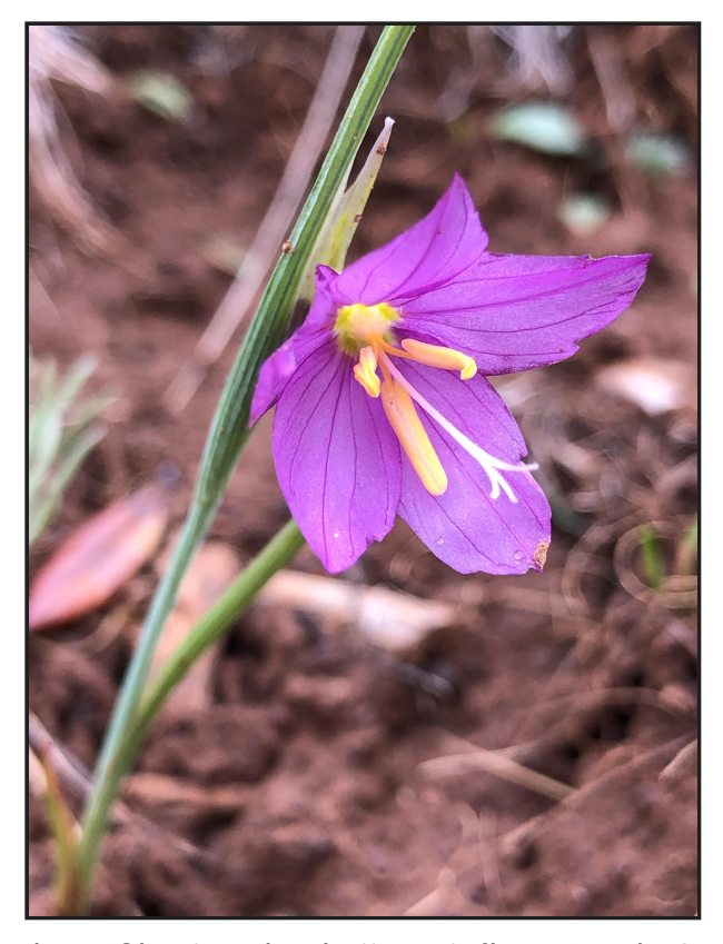
Grass widows (Olsynium douglasii var. inflatum) in the Iris family