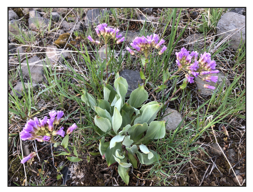
Daggerpod ( Phoenicaulis cheiranthoides ) in the Mustard family