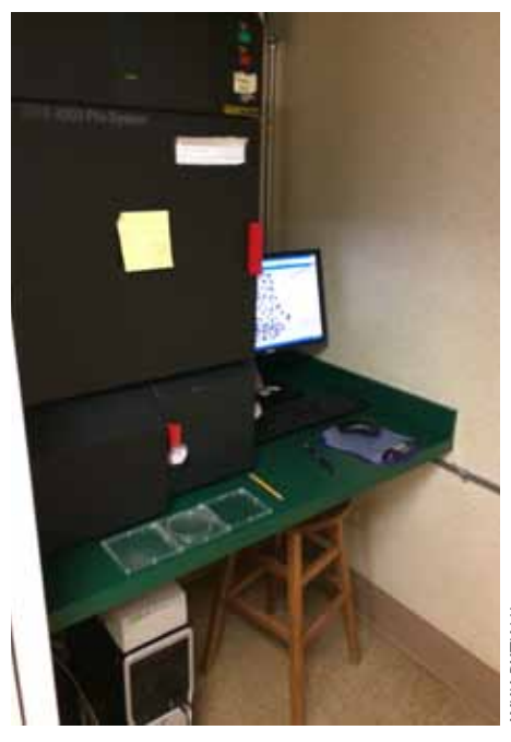
X-ray room. Non-fertile seed appears light on the screen; fertile ones appear dark.

More about herbarium vouchers: botany.si.edu/colls/collections_ overview.htm and botany.si.edu/pubs/ plantpress/vol15no1.pdf