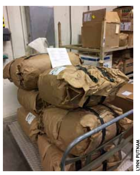
A typical "collection," one species from a particular location, kept completely separate from other collections.