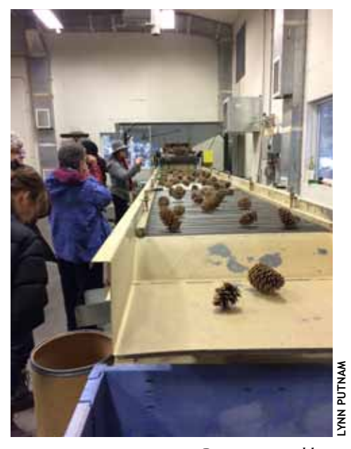
Pine cone tumbler