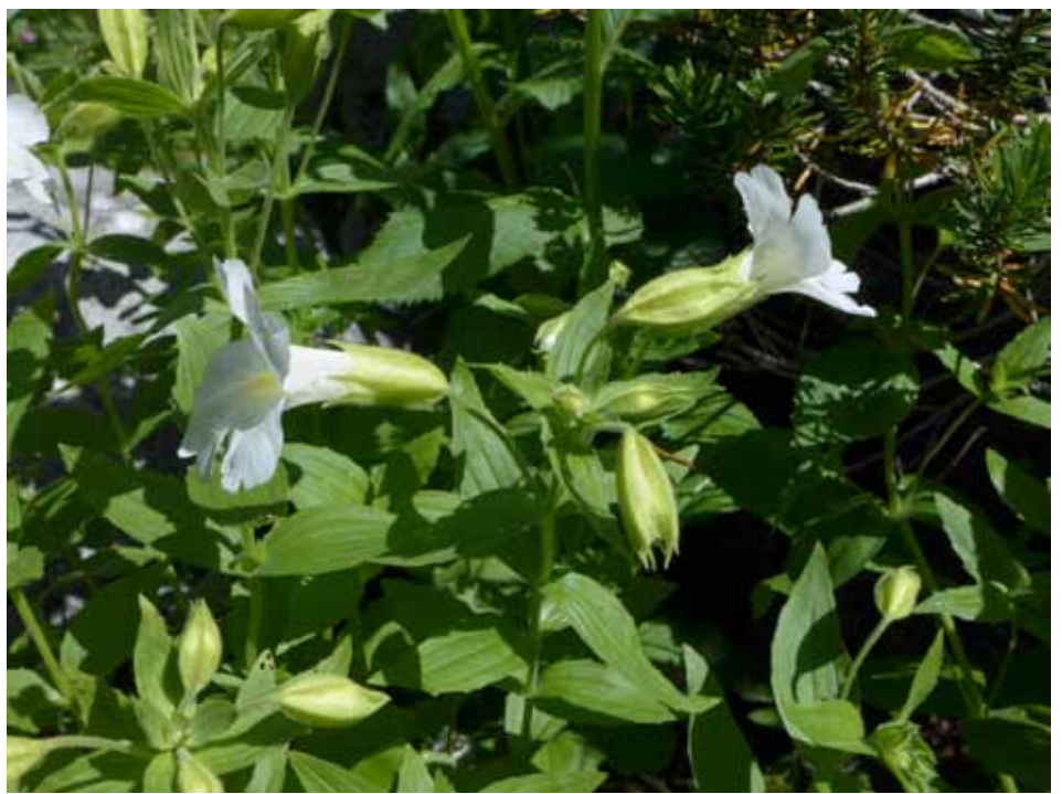
Rare albino Lewis monkeyflower.

However, pollination is often not involved in albino rarity because anthocyanins do more than just color the flowers. They occur throughout plant tissue and have been shown to protect the leaves and stems from damage by too much solar radiation. Anthocyanins and especially their flavonoid precursors also help protect plants against diseases and insect pests. So anthocyanins and the genetic machinery that make them have a number of functions besides just coloring the flowers and helping attract pollinators, although this is probably what is most noticeable continued on page 8