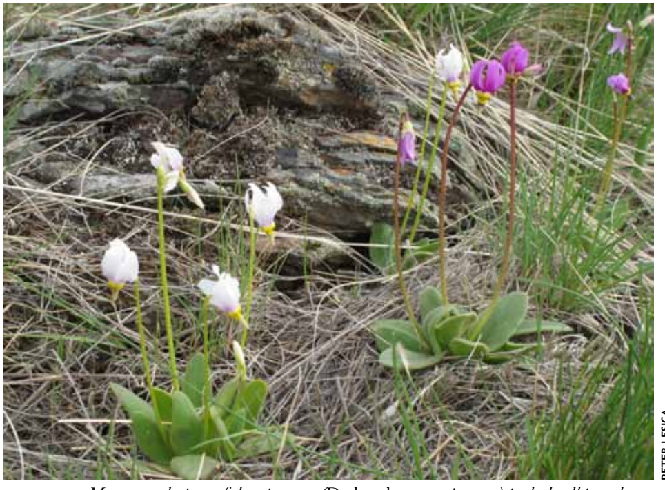
Many populations of shooting star (Dodecatheon conjugens) include albino plants.