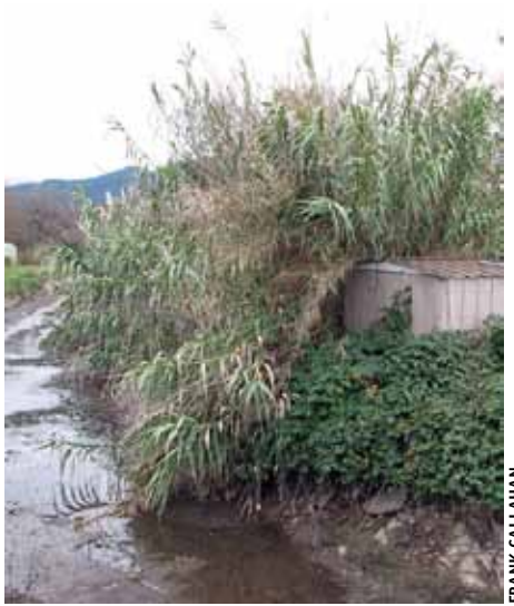
Arundo donax growing in Talent, Oregon. Frank Callahan notes that A. donax winters very well in Jackson county and is nearly as invasive there as many bamboos.

As previously expressed, NPSO opposes all growing of A. donax in Oregon, due to its track record as a highly invasive species. Although a regulated control area has been established, there are grave concerns that the regulations are inadequate to contain plants within their production area, as they do not take into consideration propagation by seed, transport by animals, growth outside of wet ground, and invasiveness of variegated varieties. NPSO compiled statements from several members to recommend that, based on scientific and historical data, the ODA increase surveillance and monitoring for escaped plants, with the annual fee and bond also increased to cover these additional costs. In addition, some proposed regulations supported by NPSO were not included in the permanent rule: maintaining a 1/4 mile buffer betwee