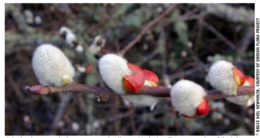
Salix hookeriana, also known as coastal willow or Hooker's willow is a member of the Salicaceae family. This photo was taken in February at Cascade Head.

Buds are embryonic branches that bear miniature leaves or flowers. The buds are often covered by one or more leathery scales. The number and orientation of bud scales can be useful in identification. For example, blueberries and whortleberries (Vaccinium) can be recognized by their buds consisting of two erect, non-overlapping scales, while willows (Salix) are easily identified by their single, large bud scale. Most winter shrubs and trees in our area have numerous bud scales that overlap like roof shingles. One exception is Canada buffaloberry (Shepherdia canadensis) which exposes its embryonic leaves directly to the elements