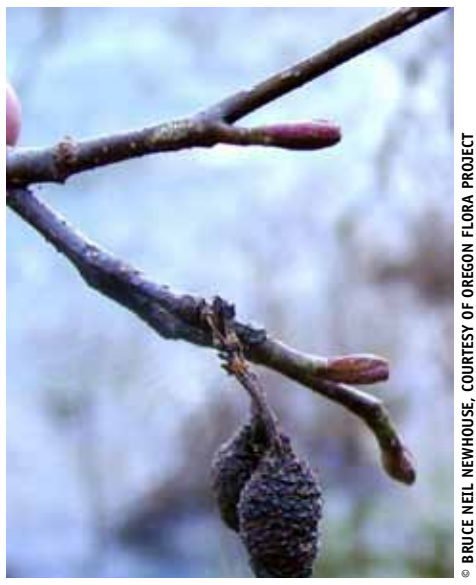
Red alder (Alnus rubra) along Smith River in Douglas County.

be helpful in identification when present. The presence of thorns (sharptipped modified branches, often with