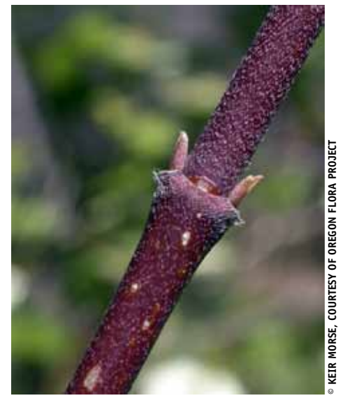
Cornus nuttalli (Pacific dogwood, western flowering dogwood) in April at Deer Creek Center in Selma.

leaf scars) helps identify hawthorns ( Crataegus ), while remnant spines (derived from stipules) and prickles (epidermal outgrowths) serve to identify gooseberries ( Ribes ) and roses ( Rosa ), respectively. Stubby branches crowded with leaf scars called spur shoots are characteristic of many cherries ( Prunus ) and serviceberries ( Amelanchier ). Warty lenticels, glandular dots, and presence or absence of hairs are other surface