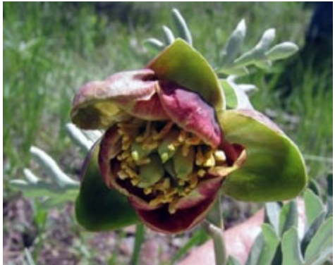
Western peony, Paeonia brownii, in bloom

Fritillaria atropurpurea, and the floral highlights just got better as we hiked up through open forest and rocky meadows. In the forest our native peony, Paeonia brownii, was in bloom and morel mushrooms, Morchella deliciosa, were at their prime. A cliff face covered with colorful lichens was topped with beautiful gnarled mountain mahogany, Cercocarpus ledifolius var. ledifolius, at the base of the cliff were numerous bunches of creamyyellow clustered broomrape, Orobanche fasciculata. As we climbed higher the forest gave way to rocky meadows dotted with blues of stickseed, Hackelia micrantha, spurred lupine, Lupinus arbustus, and larkspur, Delphinium nuttallianum, reds and yellows of paintbrush, Castilleja applegatei v. pinetorum and balsamroot, Balsamorhiza sagittata,