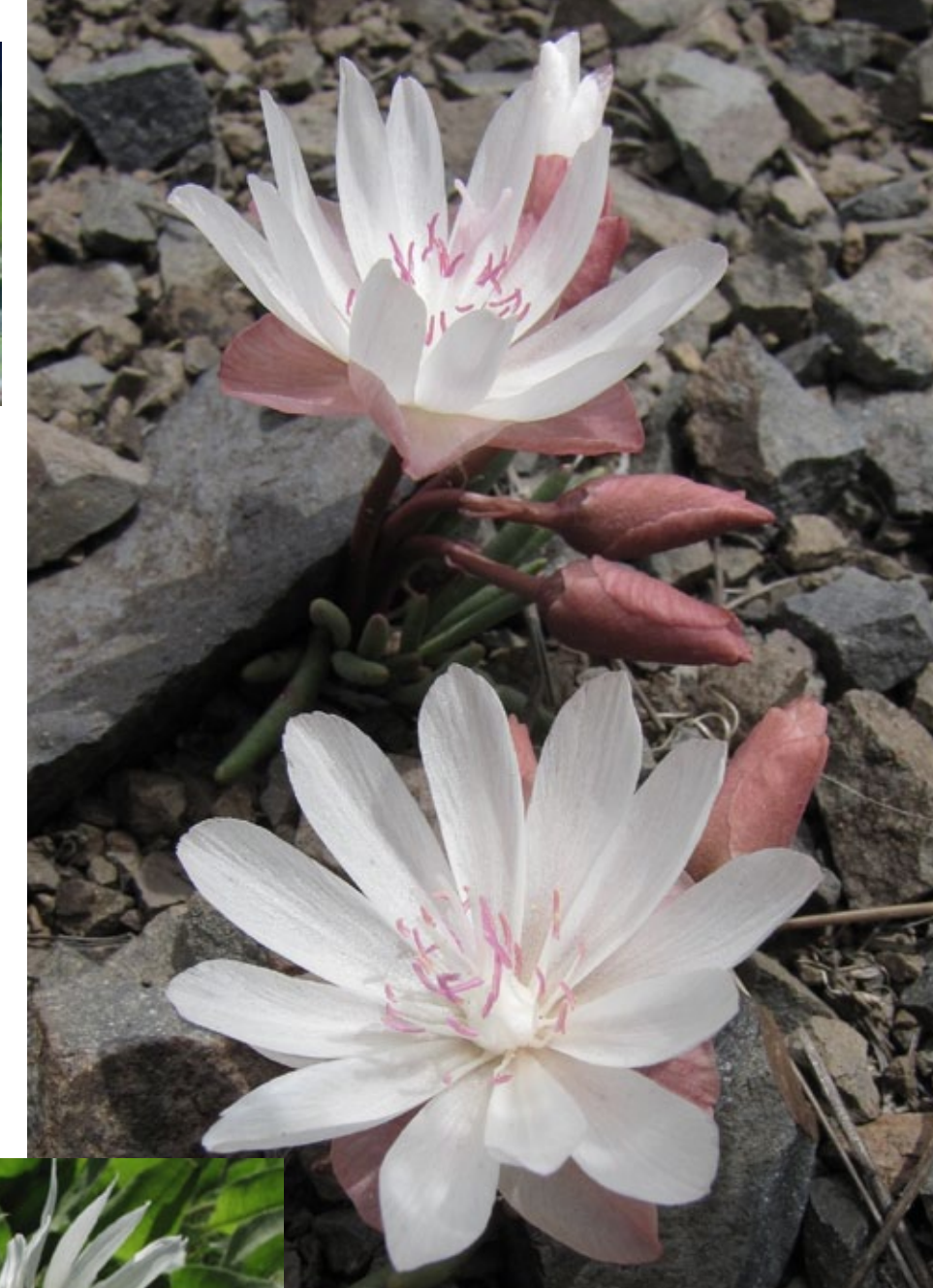
Bitterroot, Lewisia rediviva with rose-color flower buds and pink bloom!"

Fritillaria atropurpurea, and the floral highlights just got better as we hiked up through open forest and rocky meadows. In the forest our native peony, Paeonia brownii, was in bloom and morel mushrooms, Morchella deliciosa, were at their prime. A cliff face covered with colorful lichens was topped with beautiful gnarled mountain mahogany, Cercocarpus ledifolius var. ledifolius, at the base of the cliff were numerous bunches of creamyyellow clustered broomrape, Orobanche fasciculata. As we climbed higher the forest gave way to rocky meadows dotted with blues of stickseed, Hackelia micrantha, spurred lupine, Lupinus arbustus, and larkspur, Delphinium nuttallianum, reds and yellows of paintbrush, Castilleja applegatei v. pinetorum and balsamroot, Balsamorhiza sagittata,