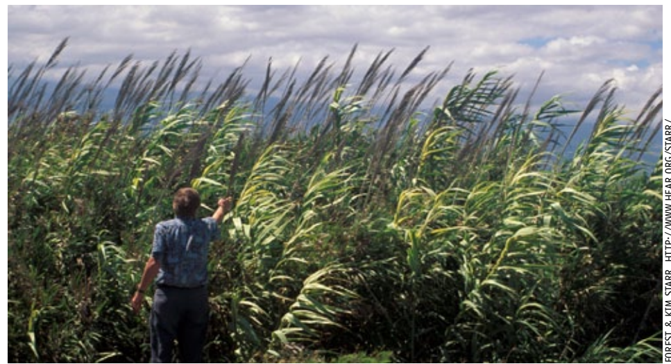
Giant cane (Arundo donax) is native to eastern and southern Asia, grows in dense stands and can reach heights of 6-10m.

There will soon be more information, with links to research and background, on the NPSO website. In the meantime, PLEASE EMAIL/WRITE YOUR LEG-ISLATOR! Visit http://www.leg.state.or.us/ to find yours!