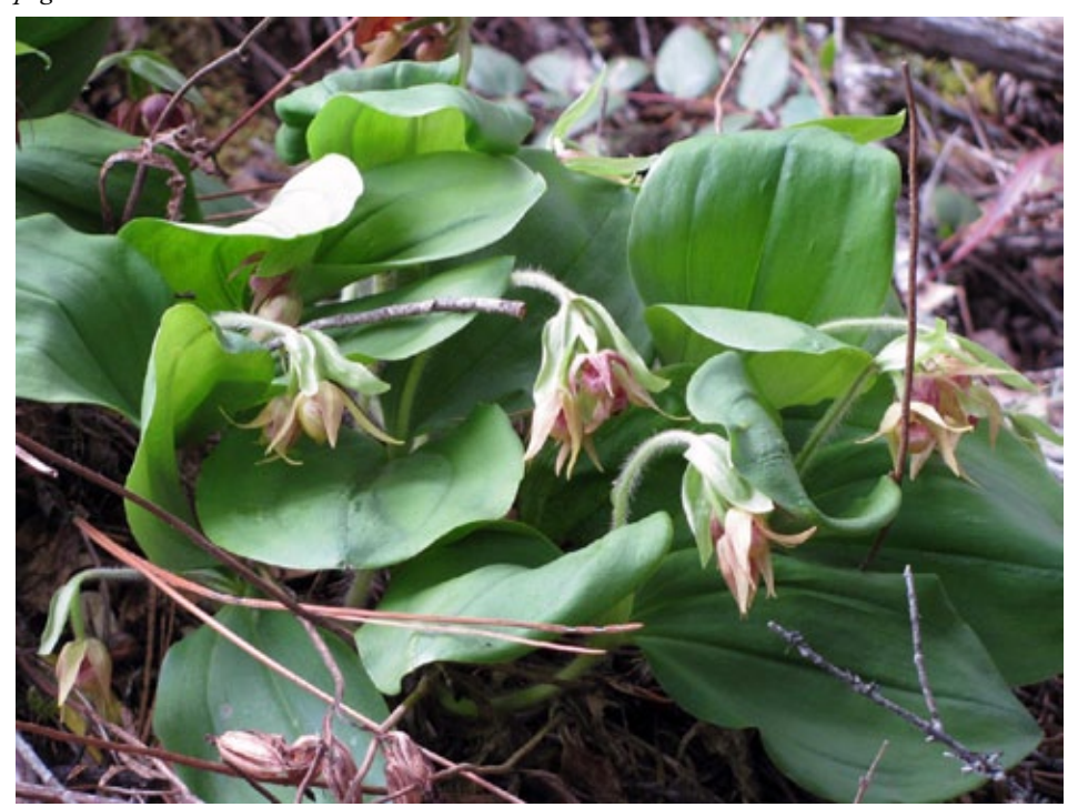
Clustered lady's slipper, Cypripedium fasciculatum, in southern Oregon.

Cypripedium fasciculatum, continued from page 1