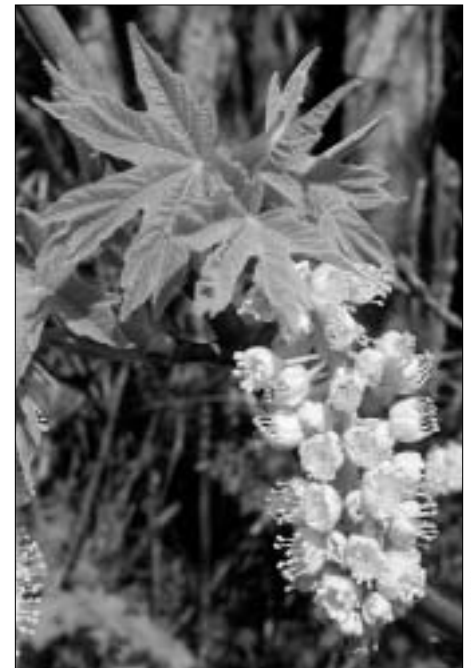
Bigleaf maples (Acer macrophyllum) open their large pendulous racemes of yellow-green flowers in March in the lowlands.

For information on the William Cusick Chapter call Frazier Nichol at 541-963-7870.