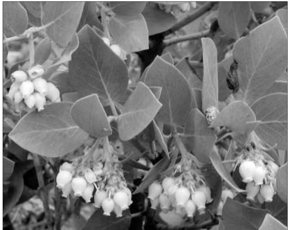
Manzanitas are early bloomers and green-leaf manzanita (Arctostaphylos patula) is no exception. It occurs from southwest Oregon up through the Cascades on both the east and west slopes. At its lowest elevation sites it may start blooming as early as March. It differs from the common hairy manzanita (Arctostaphylos columbiana), which grows in similar areas in the Cascades, by its greener leaves and lack of long bristly hairs.