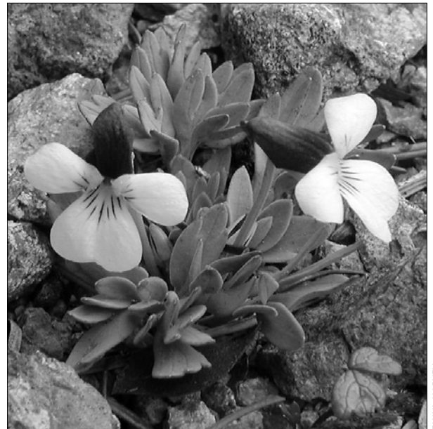
The red-violet upper petals of Viola hallii contrast beautifully with its white lower petals, each of which has a bright yellow blotch and red-violet veins. It is found in open forests, grassy hills, serpentine and gravelly soils of southwestern Oregon and northwestern California.

I still dream about the creeks and rocks and cliffs in Douglas county. I returned for two more field trips, once with my whole family, to see the red-backed petals of Ranunculus austro-oreganus (southern oregon buttercup), a whole field turned pink by Thysanocarpus radians (large fringpod), the delicate petals of Coptis lancinata (Fern-leaved goldthread), dazzling Silene hookeri (Indian pink), and Viola hallii blooming. I really appreciate the Umpqua chapter letting me come along on their field trips. They have all been very warm and friendly to me. I'm looking forward to the 2005 NPSO annual summer meeting in Roseburg. They are going to share some of their best wildflower sites (see the field trip schedule March Bulletin ). And then I can share them too.