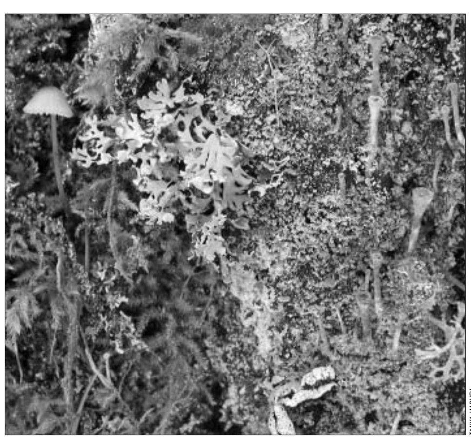
The bark of a living Douglas-fir holds a lilliputian world of lichens, moss and even a tiny mushroom. The winter is a great time to study lichens and mosses as this is when they are active and fruiting. Take a closer look at tree trunks and branches and rocks and you'll find an incredible diversity of lichens. Even on one trunk the north side has a different community than the drier south-facing side. To find out more about lichens head out with an expert on the Emerald Chapter's lichen walk in February (see Calendar next page).