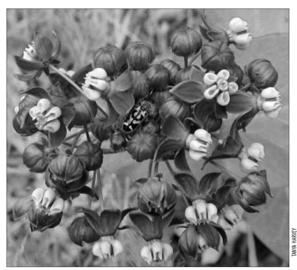
Asclepias cordifolia, Purple or Heartleaf Milkweed, grows on dry semiopen forest slopes as was this plant along Highway 66 on the way up to the Green Springs Inn. The flowers are a lovely two-toned red-violet and white and there is red in the stem as well. The leaves are smooth, somewhat heart-shaped, very flat and overlap each other around the stem. As with other milkweeds the flowers are fragrant. All in all it is a very handsome plant.