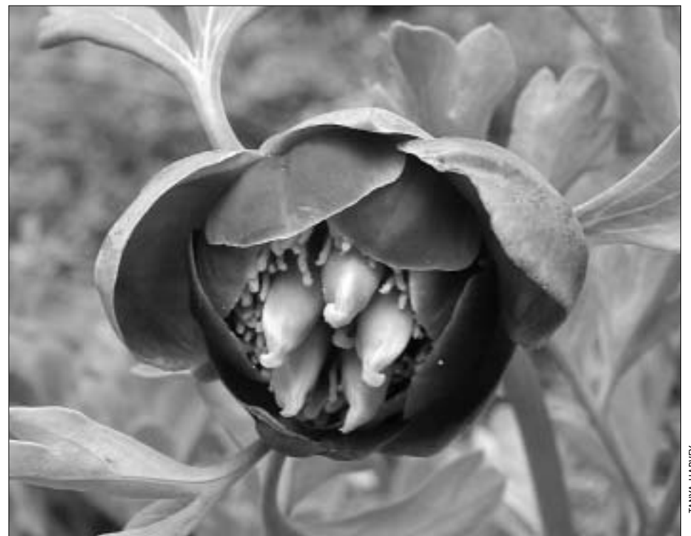
Western peony, Paeonia brownii, is the only plant in its family, Paeoniaceae, in the state. It has a large and most striking and fascinating flower. The maroon petals surround many yellow stamens. The foliage is quite lovely—waxy-blue and deeply-lobed leaves 6-24" tall. It grows in sagebrush and pine forests in arid areas of Oregon and the Great Basin.

In spite of its present monument status the area still needs greater protection. As part of the Oregon Wild 2002 Wilderness Bill, 23,00 acres of the 53,000 acre Monument would be set aside as wilderness. It is very important that this biologically-rich area have as much protection as possible. National Monument status is defined individually for each area. There are many opportunities for the multi-use factions to undermine the safety of the Monument. Wilderness status would afford a much greater level of protection. Please contact your legislators now and let them know you support wilderness status for this area as well as for many others around the state. For more information visit www.oregonwild.org.