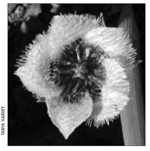
A number of Cat's ears (Calochortus tolmiei) in the Monument seem to have more than their normal share of three petals.

Field Trip: Bald Mtn. About 6 miles round trip, about 800' elevation gain. Hike from Lolo Pass Road up the PCT to an alpine meadow with a very close view of Mt. Hood. Rhodies in bloom on way up and possible Allotropa virgata . Lilium washingtonianum and Mariposa calochortus at top. Plenty of butterflies too. Meet at Gateway Park & Ride, SE corner of parking lot, at 8:30 am. Call Beth Magnus for more information, 503-226-7919.